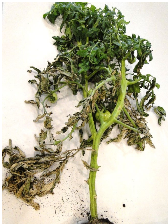
Figure 2. Stunted growth of a tomato plant

Symptoms generally are noticeable in the mid to late growing season although plants can be infected at any stages of growth. The initial symptoms of the disease are drooping and yellowing of leaves, often on one side of the plant, which may recover during the evening hours. As the disease progresses, wilting of the plant gets worse and become permanent. The disease also causes stunted growth of the plant. The earlier a plant is infected, the more severe the stunting is. Over time, severely infected plants will die, while others just perform poorly and produce few