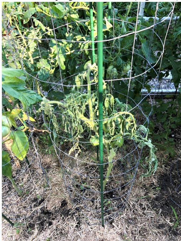
Figure 1. Wilting of leaves of a tomato plant

Fusarium wilt of tomato is a systemic vascular disease. The pathogen enters tomato plants through roots and colonizes the plant's vascular tissues, which clogs the xylem and causes drooping of leaves (Figure 1).