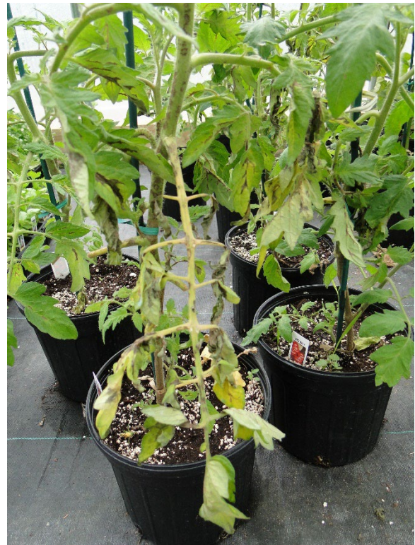
Figure 6. Edema damage on tomato leaves, petioles, and stems.