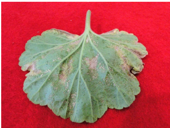
Figure 1. Water-soaked blisters and corky spots on the lower side of a geranium leaf.

The initial symptom of edema appears small water-soaked blisters on the lower side of leaves, and then they become raised, warty, scaly appearance (Figure 1). As blisters develop and merge, affected leaf tissues turn yellow or brown, which is also noticeable on the upper side of the leaf (Figure 2). In some cases, edema may cause large necrotic lesions (Figure 3) that often resemble fungal