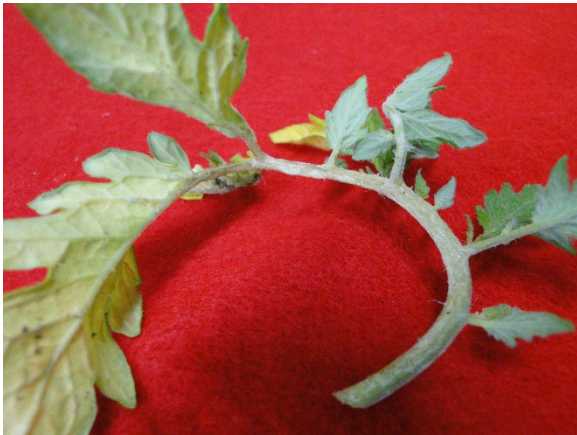
Figure 4. White blisters on a tomato petiole, which leads curling of leaves.