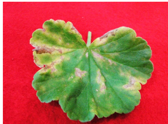
Figure 2. Chlorosis and light brown necrosis on the upper side of a geranium leaf.

Edema occurs when water that is taken up by plant roots is more than it is evaporated through the leaves. The favorable conditions for edema development are a combination of warm and wet growing media, cool night air temperatures, and high relative humidity. Excess water in plant cells results in abnormal expansion of the cell and even splits or cracks of the tissues. Edema is an abiotic disorder that does not spread from one plant to another.