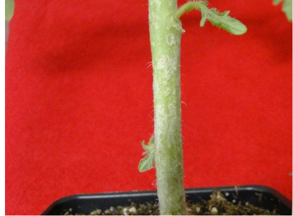
Figure 5. White blisters on the stem of a tomato transplant.