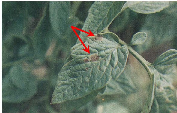
Figure 1. Dark brown or black concentric lesions (arrows) on tomato leaves.

The fungus can infect most parts of a tomato plant, including leaves, stems, and fruit. Lesions on leaves first appear as small (less than 1/16 inch) brown spots surrounded by yellow discolorations. Diagnostic symptoms develop as the spots enlarge and become dark brown or black lesions with concentric rings, usually 1/3 to 1/4 inch in diameter (Figure 1). Under favorable conditions, many lesions coalesce and result in severe defoliation and sunscald of fruit.