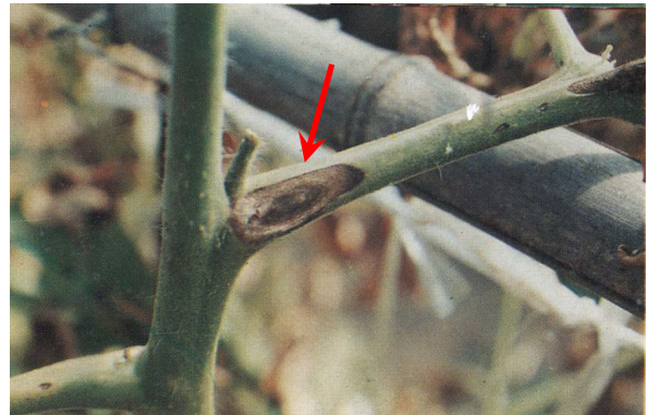
Figure 2. An elongated concentric lesion (arrow) on the stem.

Fruit can be infected during the green or ripe stage. Sunken lesions with concentric rings of