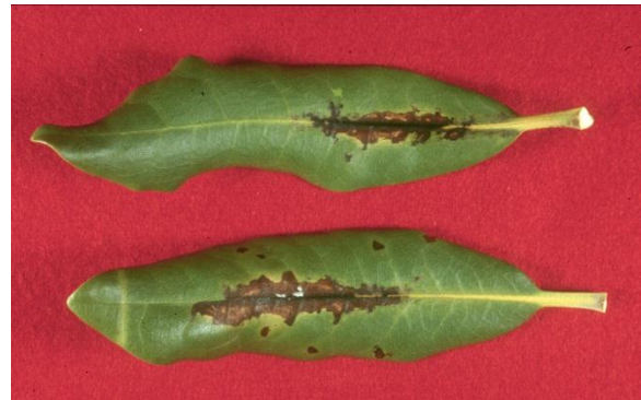
Figure 11. Rhododendron leaves with symptoms of leaf flooding.

Symptoms: Leaves initially develop dark, water-soaked blotches as a result of water infiltrating the intercellular spaces, especially along the mid-vein. Under normal conditions, these air-filled intercellular spaces comprise 10-20% of the leaf. The extent of flooding depends upon the duration of favorable conditions and cultivar. On some plants, flooding can disappear after conditions improve. On others, the blotchy areas become necrotic (Figure 11). Nova Zembla is highly susceptible whereas Roseum Elegans rarely develops leaf flooding symptoms.