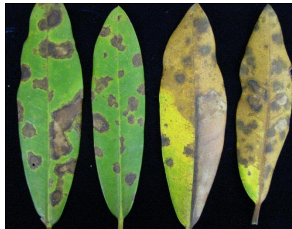
Figure 1. Fungal leaf spot of rhododendron.

pinhead to those that are more diffuse or even coalesce over the entire leaf. Small, black fruiting bodies may be visible on the upper or lower surfaces of the spots (Figure 3).