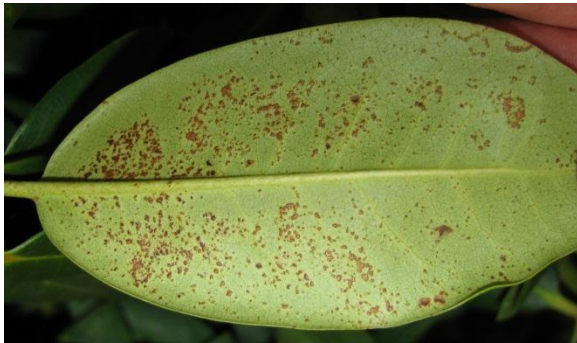
Figure 9. Oedema of rhododendron: upper leaf surface with pale chlorotic areas (top photo); brown, corky blisters (bottom) associated with oedema.