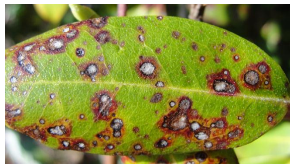
Figure 2. Characteristic leaf spots with distinct margins.