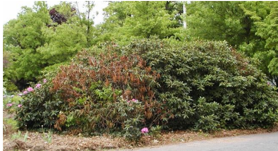
Figure 12. Winter injury symptoms on one portion of an established plant.

Symptoms: Winter injury or winter drying of rhododendron and azalea commonly occurs on plants growing in both wind-swept and sheltered locations. This is a general term applied to a group of environmentally-caused problems that have little in common other than they occur during the winter. Winter injury is important in and of itself, but it also predisposes the plants to secondary invaders or opportunistic pests. Quite often, the effects do not show up immediately after the damage has occurred. Symptoms can develop on one or two individual branches or on the entire shrub (Figure 12). They can appear as tip or marginal browning of leaves, dieback of tips and branches, desiccation of growing tips or twigs, and longitudinal rolling of leaves along the mid-vein (Figures 13 and 14). Water evaporates from the leaves on windy or warm, sunny days and cannot be replaced since the water in the soil is still frozen or unavailable to the plant roots.