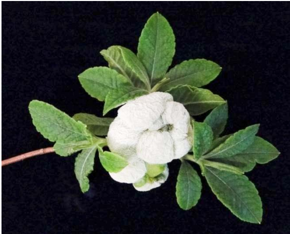
Figure 6. Older azalea leaf gall covered with the white spores of the fungus.

Galls are initially pale green in color, but develop a white “bloom,” which consists of spores of the causal fungus. The galls eventually turn red and brown and shrivel into hard masses (Figure 7). The severity of the disease usually depends on the weather and history of disease. Favorable weather includes prolonged bud break due to cool temperatures and adequate rainfall or dew to provide free water on the plant tissues. The