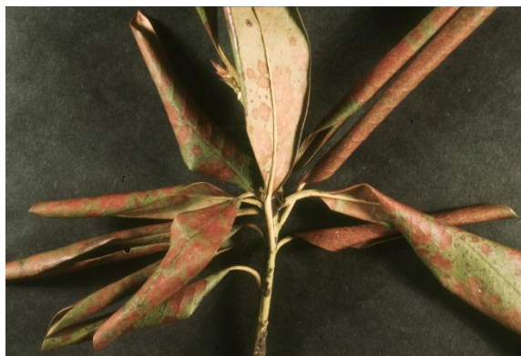
Figure 14. Close-up of winter injury symptoms.

Plants that have been recently transplanted and lack well-developed or established root systems are most susceptible to winter