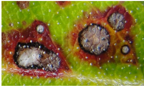
Figure 3. Small, black fruiting structures of the fungus are visible in the leaf spots.

Tan masses of fungal spores can sometimes be seen oozing from the black fruiting bodies after periods of wet weather. These tendrils consist of masses of individual fungal spores that are readily wind- or rain-driven to newly emerging leaves in spring (Figure 4).