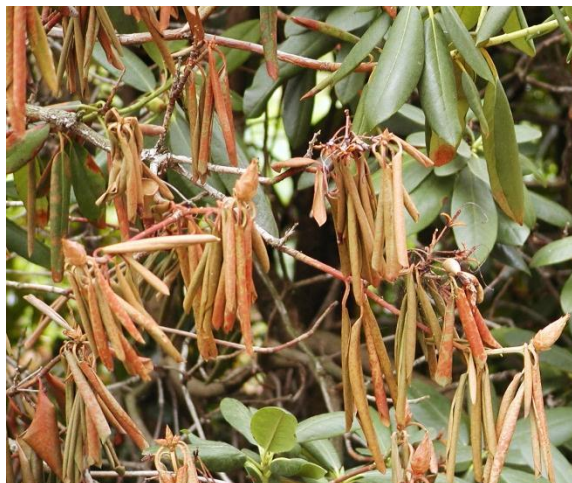
Figure 13. Diagnostic symptoms of winter injury including rolling of the leaves along the mid-vein.