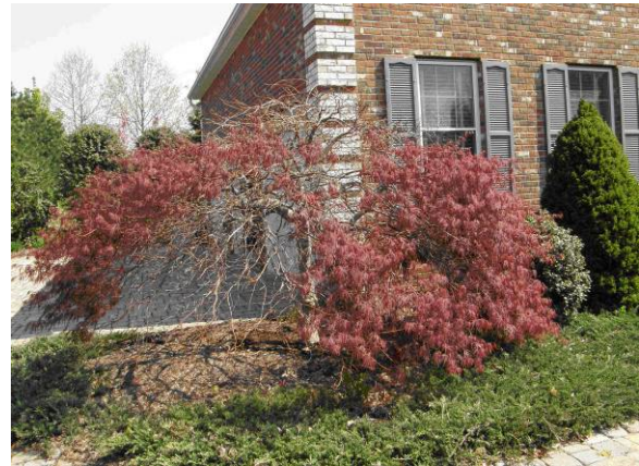
Figure 8. Japanese maple with acute symptoms of Verticillium wilt.

undersized, off-colored leaves. These trees sometimes produce heavy crops of seeds or samaras. A diagnostic characteristic of this disease is a distinctive olive-brown streaking, which may be evident in the wood of symptomatic branches or twigs (Figure 10).