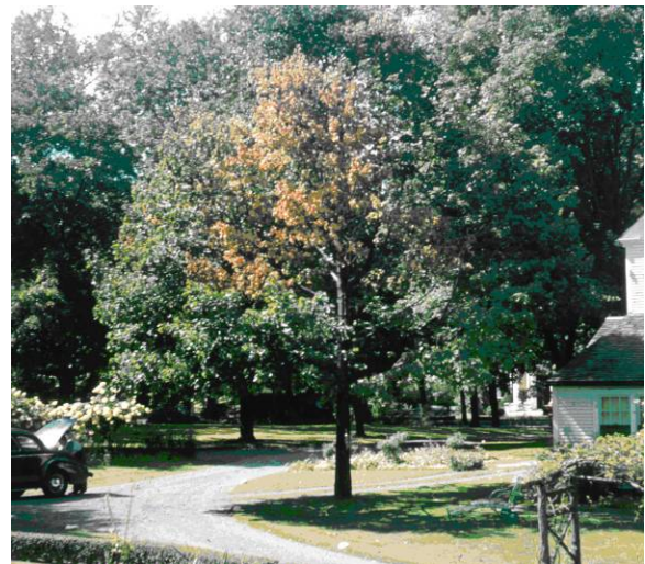
Figure 9. Maple with a portion of the canopy exhibiting premature fall coloration.

Infected trees die slowly or suddenly, depending upon the extent of infection and the overall health of the tree. Trees weakened by drought or root damage are thought to be more prone to disease.