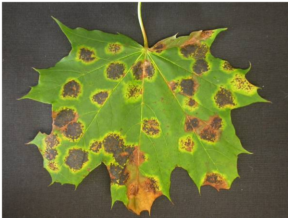
Figure 5. Tar spot on maple.

areas on the leaves. As the fungus grows within the leaf, these areas develop into distinctive, slightly raised, shiny, tar-like, black spots on the leaves (Figure 5). The size of the spot depends upon the fungal species; spots can be irregular and up to ½ inch in diameter ( R. acerinum ) or can appear as tiny, pinpoint dots ( R. punctatum ) (Figure 6). Significant premature fall coloration and defoliation can occur, especially when infection is heavy (as is often the situation on Norway maple).