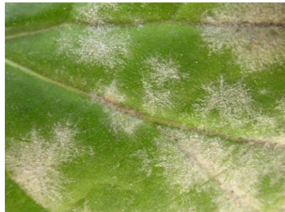
Figure 7. Diagnostic powdery growth on upper surface of a maple leaf.

Symptoms: Leaves develop a somewhat “dirty” appearance due to the presence of a white to grayish, powdery growth on the leaf surface (Figure 7). Symptoms are usually first evident on the upper surface of the leaf and can result in premature fall coloration. Unlike many other foliar diseases, powdery mildew typically develops late in the growing season. It can result in defoliation when infection is severe.