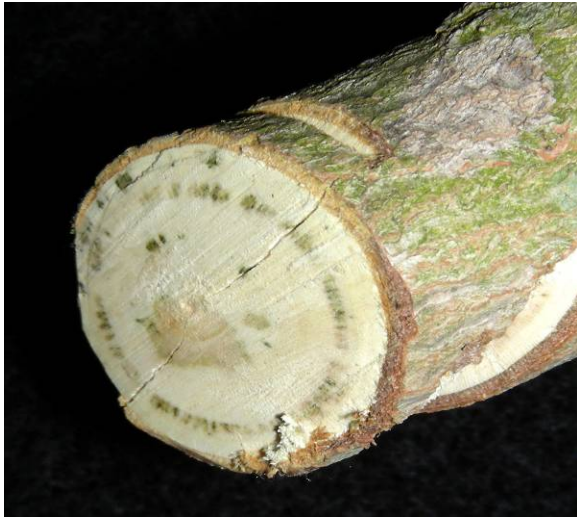
Figure 10. Diagnostic vascular discoloration in sapwood of maple infected with Verticillium wilt.