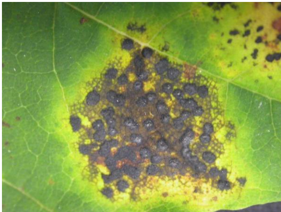
Figure 6. Close-up of the tar-like stroma of the fungus, Rhytisma spp.

Management: Refer to management strategies for foliar diseases at the end of this section.