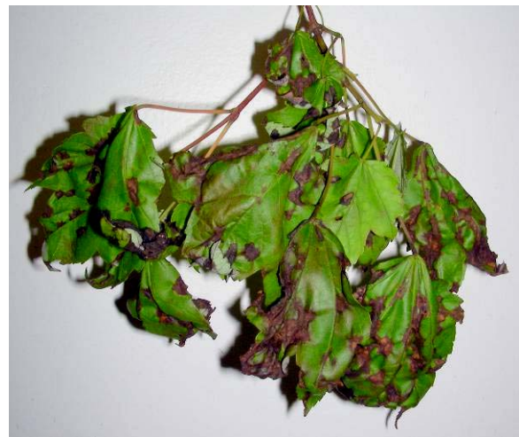
Figure 1. Typical anthracnose lesions delineated by the veination pattern of the leaves.

often apparent from late spring to early summer but additional cycles of disease can result in damage which is visible later in the growing season. The range of symptoms includes leaf spots, blighted leaves and young shoots, cankers, and dieback of young twigs and branches. The most common symptoms are large, irregular dead areas on the leaf that are often V-shaped or delineated by the veins (Figures 1 and 2).