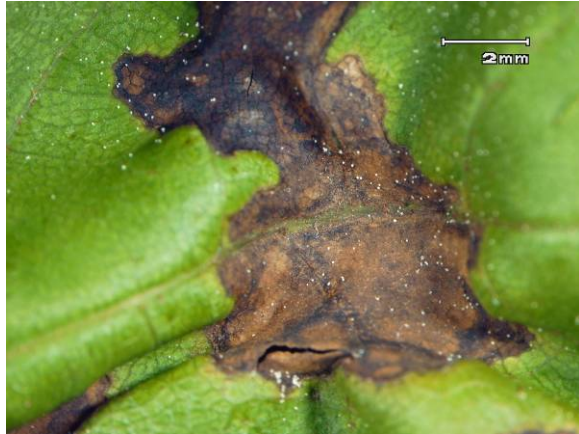
Figure 2. Close-up of anthracnose lesion.

These symptoms are often confused with drought and heat stress since they are very similar. Significant leaf drop and premature defoliation can occur. Samaras can also develop necrotic or dead spots and drop prematurely.