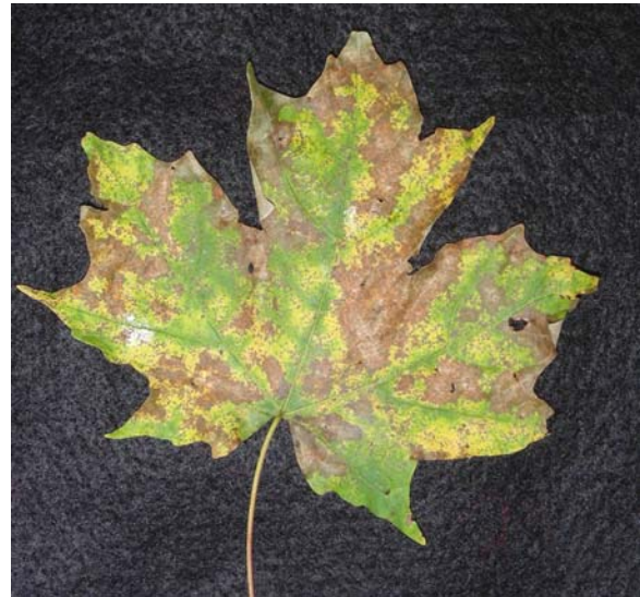
Figure 3. Septoria leaf spot of maple. Initial symptoms are small necrotic spots, which when numerous, can coalesce into large necrotic areas.

Spores of the fungi are often visible as tendrils oozing from the back fruiting bodies after periods of wet weather (Figure 4). These diseases are usually more severe on red, sugar, and silver maple but can occur on Japanese and Norway maple.