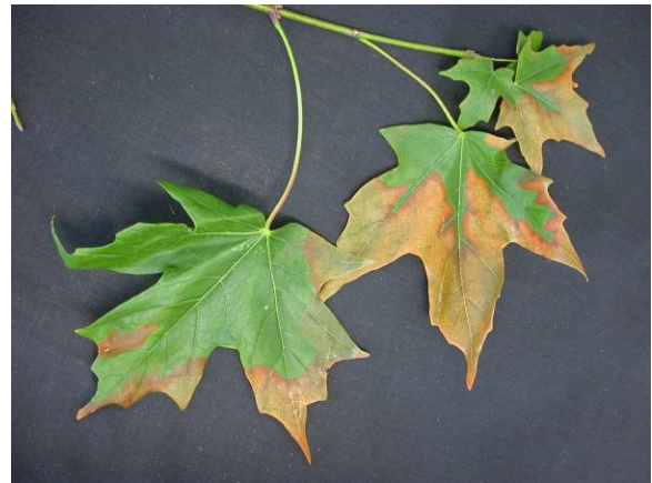
Figure 12. Marginal scorch.