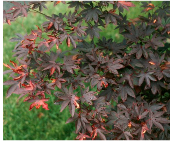
Figure 11. Japanese maple leaves with marginal scorch symptoms

necrotic or dead margins (Figures 11, 12, and 13).