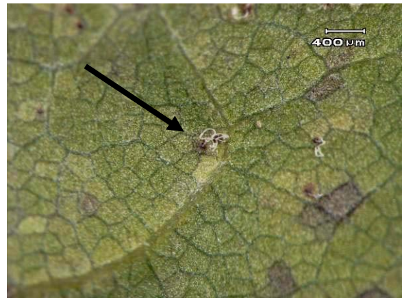
Figure 4. Close-up of tendril of oozing fungal spores (arrow) on abaxial surface of a leaf.