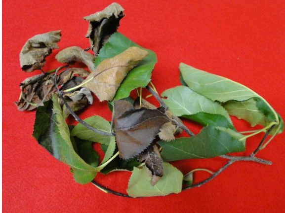
Figure 12. Blackened leaves remain attached to infected shoots.

blight is the bending of the “blighted” terminal, which resembles a shepherd’s crook.