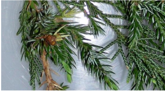
Figure 10. Dormant cedar-hawthorn gall (arrow) on juniper.