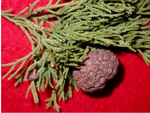
Figure 6. Dormant cedar-apple rust gall overwintering on Eastern red cedar.