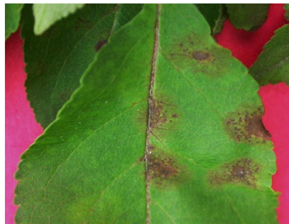
Figure 1. Olive-black, velvety scab lesions with feathery margins.

Scab, sometimes referred to as “apple scab,” is the most noteworthy and common disease of crabapple in Connecticut. It is usually most severe after cool, wet spring weather. Leaf symptoms are first visible in May or early June and appear as pale green blotches. These develop into circular, olive-black, velvety lesions with feathery margins that are diagnostic for this disease (Figure 1). These lesions are often found along the mid-