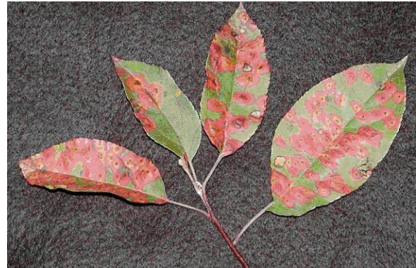
Figure 3. Symptoms of cedar-apple rust on red-pigmented crabapple (upper leaf surface).

the wind to crabapple trees where they infect and produce characteristic lesions on newly developing crabapple leaves.