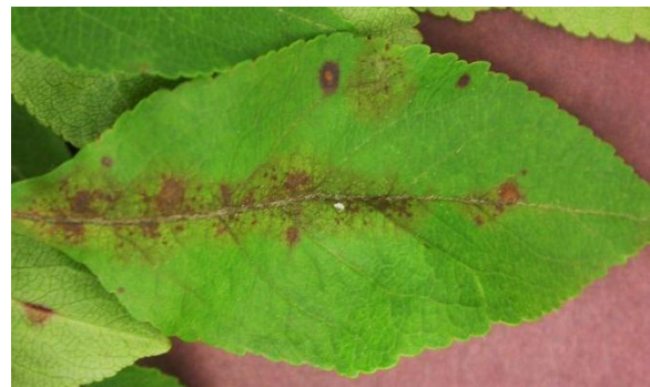
Figure 2. Scab lesions concentrated along the midvein of a leaf.

vein (Figure 2) where the leaf surfaces stay wet for longer periods of time. Infected leaves usually turn yellow or chlorotic, even when they only have a few spots. As the