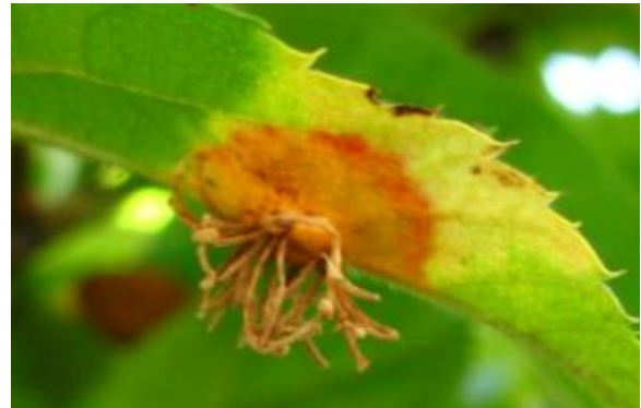
Figure 9. Long, finger-like aecia protrude from the lower surface of a cedar-hawthorn rust lesion.