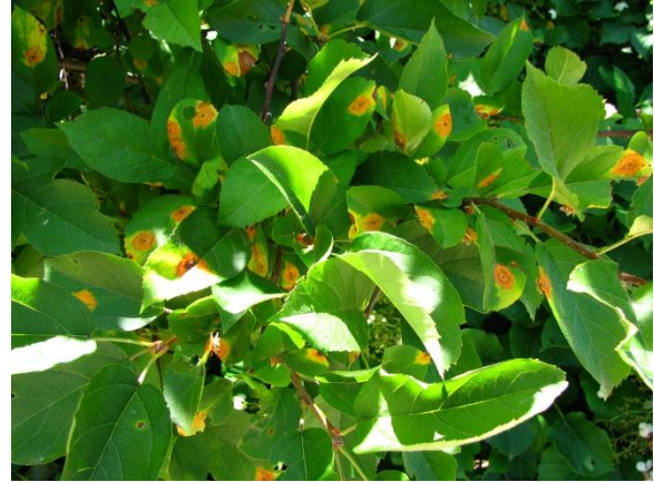
Figure 8. Brightly colored cedar-hawthorn rust lesions on crabapple.