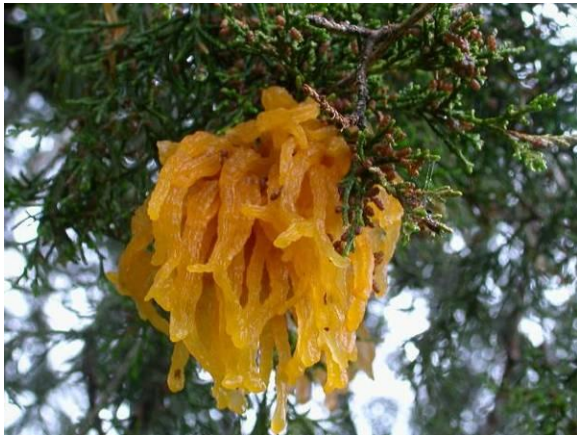
Figure 7. Spectacular, gelatinous telial horns develop from galls after rain.