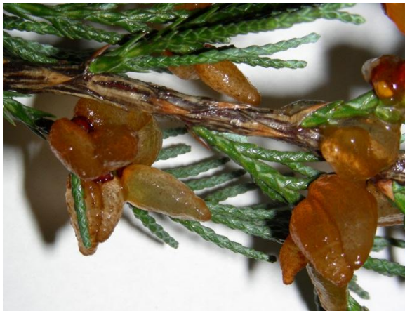
Figure 11. Telial horns protruding from cedar-hawthorn galls in spring.