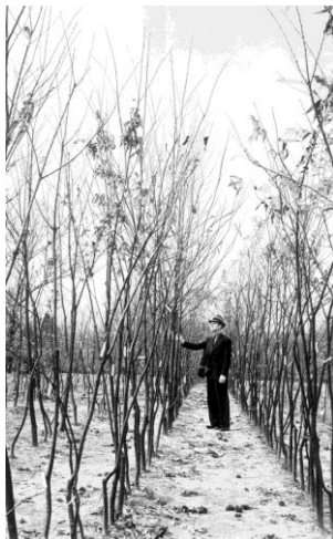
Fig. 5. R. B. Clapper with seedlings from 1931 and 1932 crosses of Japanese and American chestnuts (photo 1938).

involved making and testing hybrids for their resistance to chestnut blight and their fitness throughout the US.