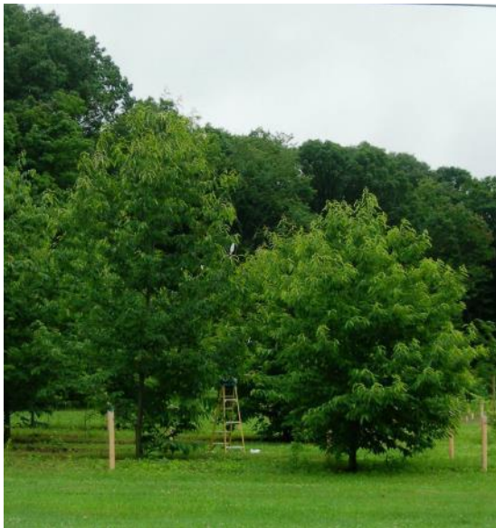
Fig. 1. A timber-form chestnut tree on the left and an orchard-form tree on the right.

The appeal of chestnut, both for timber and for nut production, has prompted importation and experimentation in the U.S. for many years.