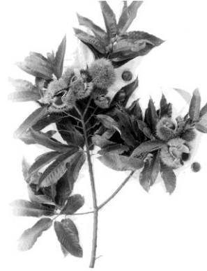
Fig. 4. A branch of Van Fleet’s hybrid growing in Bell, Maryland, in 1943.

This variety was strongly self-fertile, which is rare in chestnut (12). The other early hybridization work was done by Dr. Walter Van Fleet, then an associate editor of the Rural New Yorker Magazine. In 1894, he used pollen of American chestnut on flowers of the European (or European-American) cultivar ‘Paragon’ and planted the progeny in Little Silver, New Jersey (13). Van Fleet went on to make thousands of crosses, using many species, between 1900 and 1921. For his early crosses he used the native chinquapin, C. pumila , and European and Japanese cultivars.