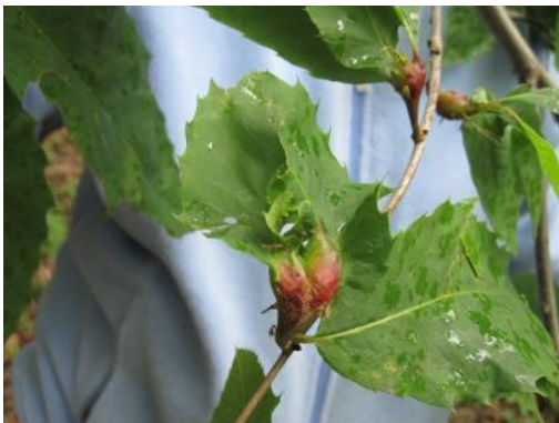
Fig. 10. Galls of Asian chestnut gall wasp on an American chestnut in Connecticut.

Our latest challenge is the recent arrival of the Asian chestnut gall wasp ( Dryocosmus kuriphilus ) in Connecticut. This pest lays eggs in leaf and flower buds, and when the eggs hatch, a gall is formed. When the wasp emerges, all the galled tissue with attached distorted leaves dies. Orchards of chestnuts in Ohio have had severely reduced nut yields as a result of infestation. Fortunately, the large collection of species of Castanea at CAES has allowed us to determine that Ozark chinquapins ( Castanea ozarkensis ) are resistant to infestation. Crosses are now underway to move wasp resistance into the important nut cultivars grown in the U.S.