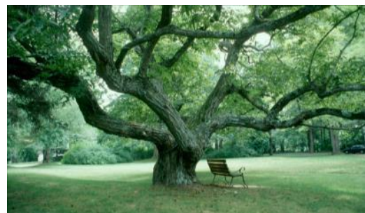
Fig. 2. 1876 Japanese chestnut tree at the Bee and Thistle Inn in Old Lyme, CT.