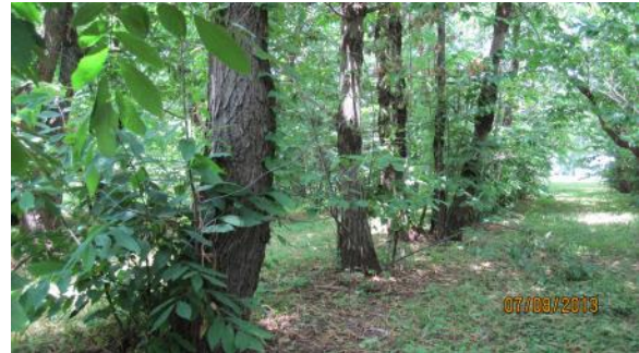
Fig. 8. American chestnut trees, 40 years old, kept alive with biological control by hypovirulence.

American chestnut trees kept alive using biological control by hypovirulence (a virus disease of the chestnut blight fungus).