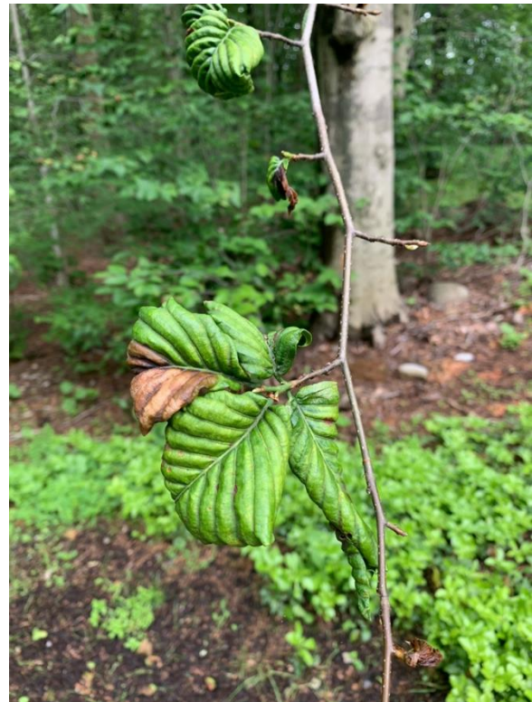
Figure 4. BLD symptoms in spring 2021, exacerbated by summer 2020's excessive heat and drought, followed by a dry March in 2021. Note the malformed and undersized leaves, excessive cupping of bands, and browning.

In 2021, many beech trees in Connecticut, both young saplings and mature trees, are exhibiting much more severe symptoms, ostensibly exacerbated by the record heat and drought of the 2020 summer, and the dry 2021 spring. In addition to aborted bud development, many of the leaves that do emerge are heavily infected, curled downward and shrunken, with all or nearly all the interveinal bands affected; in some cases, these leaves are prematurely dropped (Figure 5). Saplings and young trees are more susceptible to the disease and are reported to die within three to five years after symptoms are observed; the long-term consequence of this on forests is uncertain, but will likely result in a reduction in the proportion of American beech, and the loss of recruits for