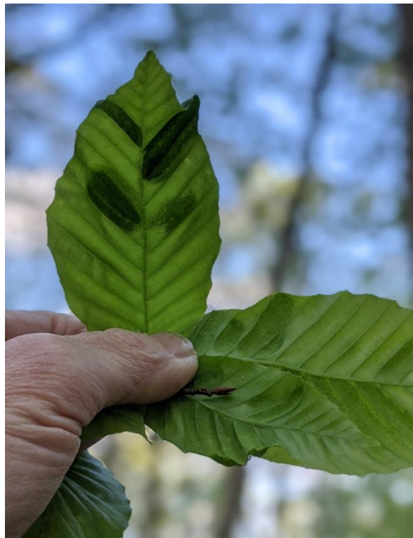
Figure 2. BLD symptoms when viewing leaf underside against light.