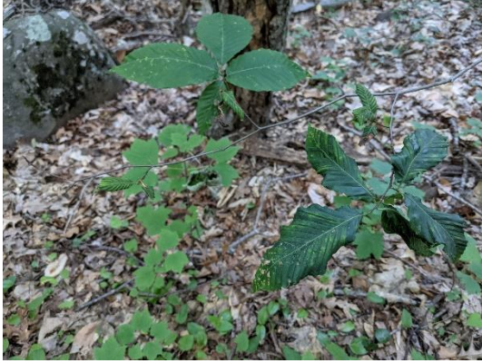
Figure 5. Shrunken, curled leaves, heavily symptomatic with BLD, on partially defoliated branches.

regeneration in forest stands. Symptoms of other pests and pathogens, such as beech blight aphid, European beech scale, eriophyid mites, and anthracnose, can superficially resemble BLD, but properly taken photographs can, in most cases, be diagnostically determinative. When in doubt, samples can be evaluated in the diagnostic laboratory.