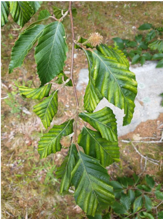
Figure 3. BLD symptoms in spring 2021, exacerbated by summer 2020's excessive heat and drought, followed by a dry March in 2021, showing chlorosis in affected interveinal bands.

The characteristic and diagnostic symptom of BLD is dark banding between leaf veins, which appears immediately upon leaf emergence in the spring; this is especially noticeable when viewing leaves from below, looking upward into the canopy against light (Figure 2). This symptom is much less noticeable when viewing the upper leaf surface; viewed from above, the affected bands will appear cupped and leathery (Figure 3). As disease progresses, the cupping becomes more pronounced, and the affected bands may turn yellow or brown (Figure 4).