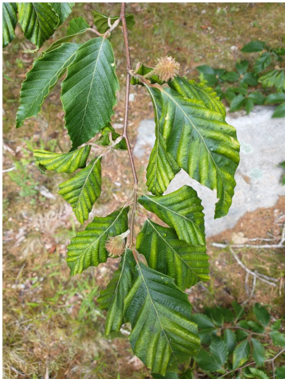
Figure 3. BLD symptoms in spring, 2021, exacerbated by summer 2020's excessive heat and drought, followed by a dry March in 2021, showing chlorosis in affected interveinal bands.

The characteristic and diagnostic symptom of BLD is dark banding between leaf veins, which appears immediately upon leaf emergence in spring; this is especially noticeable when viewing leaves from below, looking upward into the canopy against light (Figure 2). This symptom is much less noticeable when viewing the upper leaf surface; viewed from above, the affected bands will appear cupped and leathery (Figure 3). As disease progresses, the cupping becomes more pronounced, and the affected bands may turn yellow or brown (Figure 4).