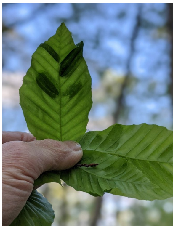
Figure 2. BLD symptoms when viewing leaf underside against light.