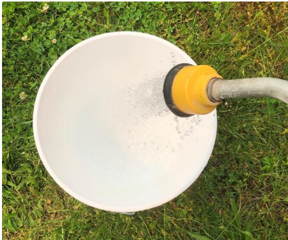
Figure 1. This bucket holds 3.5 gallons of water. You can fill the budget with a hose, or from whatever nozzle you have attached to your hose, as shown here.