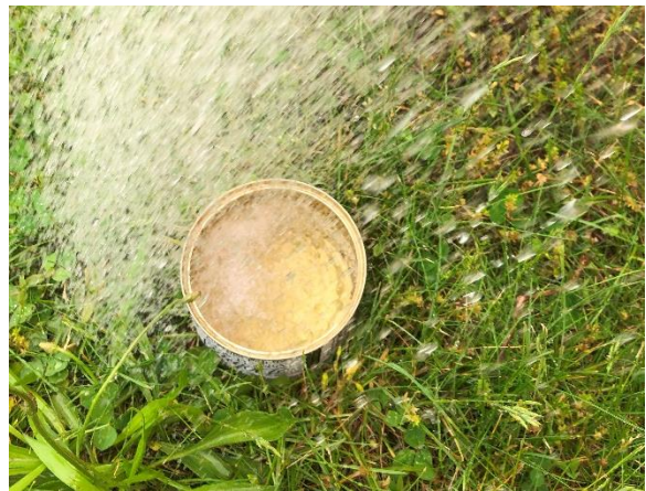
Figure 3. The marked can set under the sprinkler spray.

Time to fill containers to 1 inch: _____