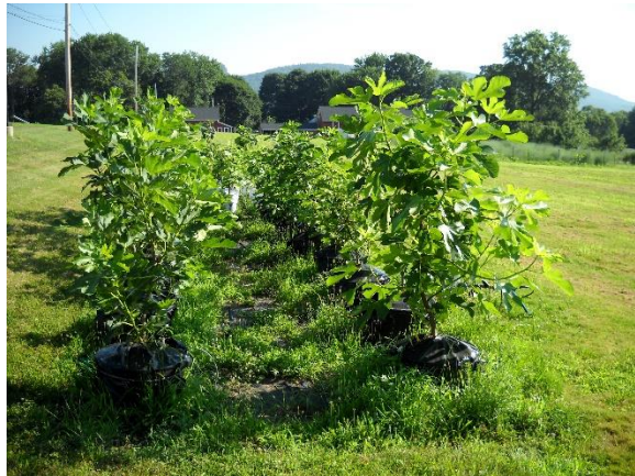
Figure 2. Trees in self-watering planters in June after being stored in a barn for the winter.

This is the initial strategy we used for overwintering our figs. Trees are stored in a barn during the cold season and brought outside two weeks before the last frost date. It is important to prevent the trees from leafing out while being stored. Figure 2 shows trees in June after they have been brought outside.