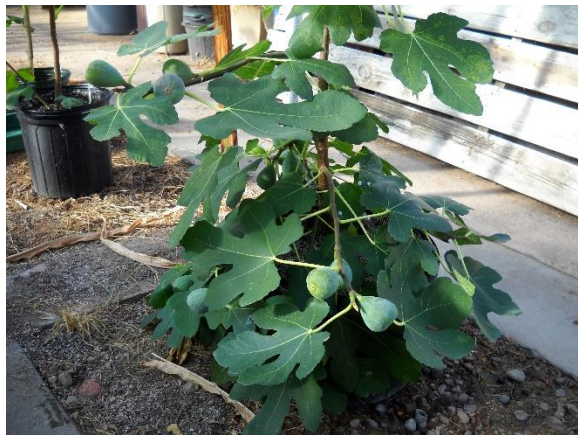
Figure 1. Figs produce fruit as they grow even in their first year; larger plants produce more figs.

There is a good deal of interest among home gardeners in growing figs in Connecticut, but commercial production is feasible as well. Good tasting, fresh figs are difficult to find in the grocery store, as figs are not ripe until they are soft and will not ripen after they are picked. In response to this interest, a fig research program was initiated at the Experiment Station. We are examining the production of six varieties of figs in plastic greenhouses. In this fact sheet we will discuss growing and overwintering figs in Connecticut, possible methods of overwintering, methods for propagating your own figs, and fig diseases. Once overwintered, figs can grow quit well in Connecticut (Figure 1).