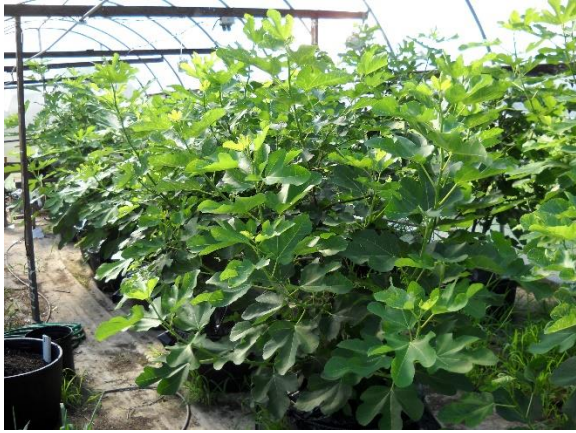
Figure 5. The lush growth of figs in a plastic greenhouse.