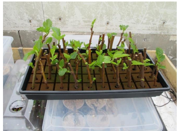
Figure 8. Rooting in a 10" X 20" tray with oasis cubes.