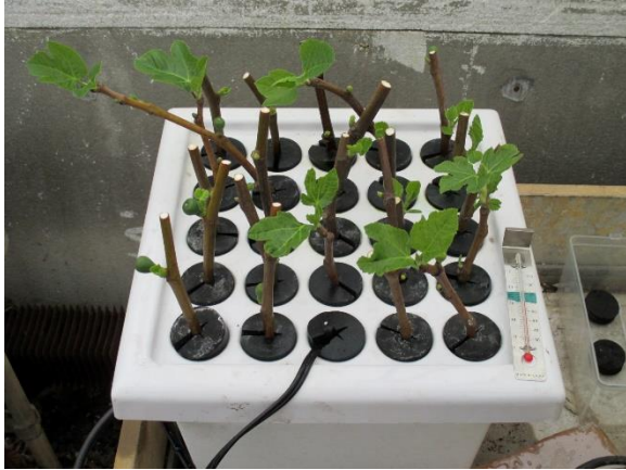
Figure 9. A hydroponic-type device that splashes the stem with a spray of water.