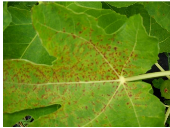
Figure 12. Rust ( Cerotelium fici ) fungus on a fig leaf.