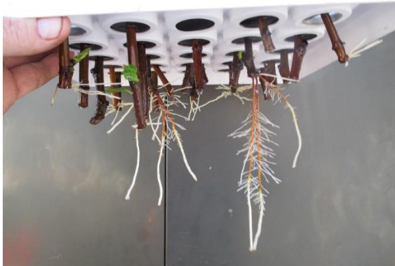
Figure 10. From beneath, root development with the hydroponic-type device