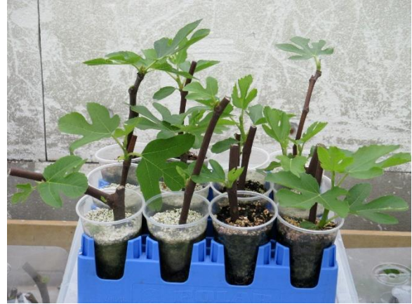
Figure 6. Scions rooting in (PP) using 14 oz cups with holes in the bottom.

Figs have been propagated for more than five thousand years. It is most common to use dormant cuttings made in late winter, but we have also had success with live cuttings and with air layering. We have not been using rooting hormone, but it would not hurt to use it. We have been experimenting with two different rooting media: 1:1:1 sand:perlite:vermiculite (SPV), and 1:1 peat moss:perlite (PP). Pelletized lime is added to both mixes: 1/4 cup per cubic foot for SPV and 1 cup per cubic foot for PP. The method involves placing a finger-width, four inch-long scion into a plastic cup with holes in the bottom (Figure 6). The rooting media should be kept moist by watering twice a week. We have also tried other methods, including bottom heating with a cover over the tops (Figure 7), rooting in inert media such as oasis cubes (Figure 8), and using a hydroponic-type device that spays the bottom of the scion with water (Figures 9 and 10).