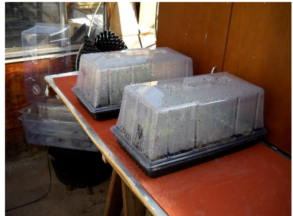
Figure 7. A 10" by 20" tray with a high dome covering. Heating pads allow for higher root temperatures if necessary. A plastic bag loosely draped around a pot would also work.