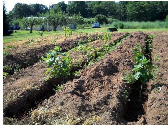
Figure 4. Training figs to grow horizontally in a trench. The shoots then will grow vertically and bear fruit.

Based on the idea of overwintering the fig tree by laying it down in a trench, and the fact that farmers in other parts of the world actually grow fig trees horizontally, we have initiated a project growing figs in trenches (Figure 4). The trees will be protected in winter by insulating them with straw and an agricultural blanket. We are in our first year of this project, which idea will take several years to evaluate.