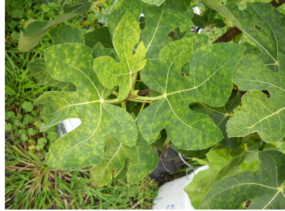
Figure 11. Fig Mosaic Virus.

The two diseases that we have detected since the initiation of the fig program are fig mosaic virus and fig rust, caused by the fungus Cerotelium fici (formerly Physopella fici ). Under good growing conditions the figs seem to be able to outgrow the virus and remain productive. Pruning for air circulation and keeping the ground dry under the figs will help prevent fig rust. Fungicidal sprays containing copper can be used to control this disease http://www.gardeningknowhow.com/edible/fruits/figs/figs-disease-rust.htm .