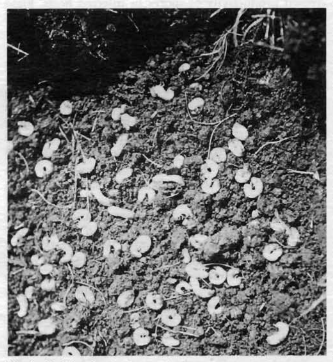
Fig. 1. Rolling back the turf shows heavy infestation of Japanese beetle grubs. Many grass roots have been destroyed. A similar infestation of Oriental beetle grubs would have much the same appearance.