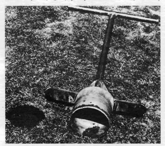
Fig. 2. Core sampler used in examining soil for Japanese beetle grubs; diam. \pm 6.4 inches.

Control was evaluated on May 24 by counting the living grubs in 1.38 ft.<sup>2</sup> of turf excavated in six random core samples (Fig. 2) per plot. The data (Table 1)