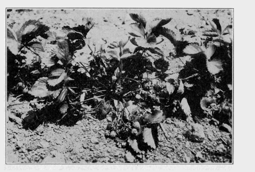
9. An individual plant of the first generation hybrid (P8B x H14B) growing in the field.

Of the 15 selections, six are single crosses, five are combinations of three inbreds and four represent combinations of four parents, partly inbreds and partly varieties. From this list two have been named and described and are now ready for distribution (Conn. Agr. Expt. Sta. Cir. 137, 1939). These are Hebron (111) and Shelton (123). Two more, 143 and 431, are equally good and probably will be named later. All four combine three or four different varieties. Since more combinations of this type were made and many more progenies grown, the conclusion can not be drawn that multiple crosses are more likely to give valuable combinations than single crosses. Furthermore it cannot be stated positively that crosses of inbreds are any more likely to give good results than crosses of varieties. The original plan was to have an equal number of both types of crosses and to compare the number of selected lots in both groups. However, the number finally selected is no greater than is usually obtained from a large series of varietal crosses and it is not known yet whether or not any of these final selections can compete successfully with the original varieties from which they came or with varietal crosses now being made elsewhere.