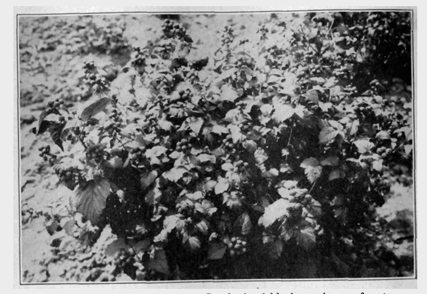
11. An individual plant of the Cumberland black raspberry after two generations of self-fertilization.

more numerous than those of either parent.