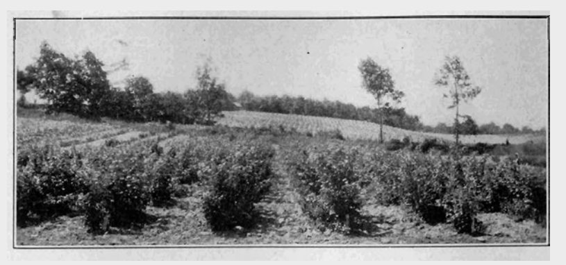
10. A field of black raspberries two generations self-fertilized.

There was much variation in time of flowering, appearance of ripe fruit and in size of berry. All of the healthy plants were productive although the development of the fruit varied widely. In about half of the plants it was well filled, indicating complete fertility of the individual ovules. The others showed partial abortion with consequent imperfect development of the fruit. With these results in mind there can be no doubt about the heterozygous condition prevailing in the original variety of black raspberry. In view of this marked segregation in both qualitative and quantitative characters, it is surprising that the plant growth and fruitfulness held up so well. In the second generation many progenies were as uniform as the original variety and some were even more productive. Two of the most promising lines were again self-fertilized and have been grown for several years in an isolated field with the original variety for comparison in yield and fruit characters. So far both inbred lines have proved to be more productive.