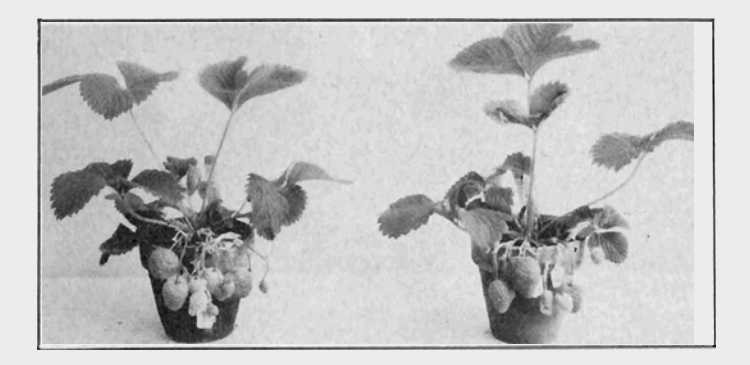
5. Four individual plants of the first generation hybrid (P3B x H14B). All of the fruit buds were emasculated and pollinated by hand.

The conditions under which the fruit was borne this second year approximated the usual fruiting conditions in a production field where the plants are grown in a matted row. Being cultivated both ways, there were more outside plants bordering on cultivated areas. They were not mulched as it was desired to eliminate all that were not winter hardy.