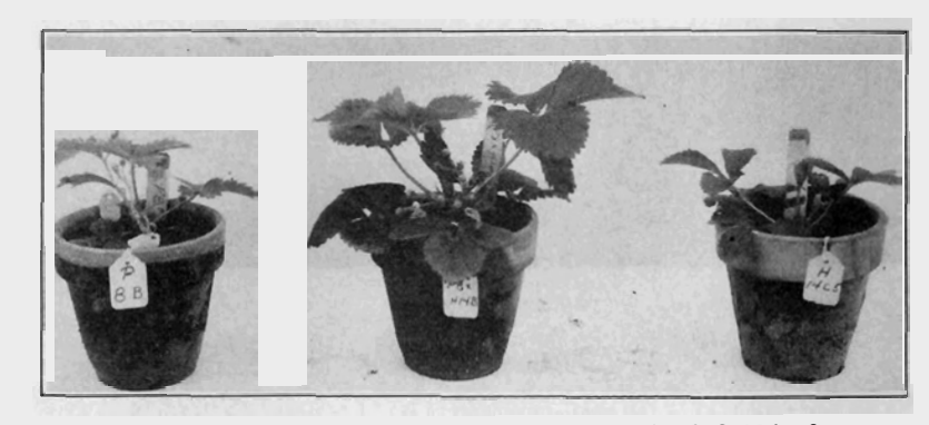
4. Two inbred strawberry plants and their first generation hybrid in the center.

For THE production of crossed seed, runners were rooted in two and one-half-inch pots. As soon as the young plants were well established they were transferred to four-inch pots in good potting soil and placed in a cold frame in late fall. When growth stopped the plants were mulched and allowed to remain outdoors until January. This exposure to low temperatures is necessary for the production of fruit buds. The plants were then brought into the greenhouse and kept for two weeks at a temperature below 50 degrees F. and then raised to about 80 degrees F. The daylight period was extended two or three hours with lights (Figure 3).