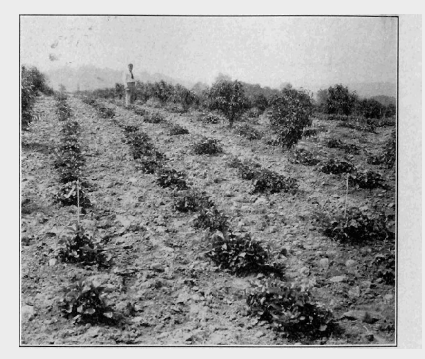
6. Crossbred strawberry seedlings in blossom the first year after setting in the field in July.

After fruiting, the squares were thinned with a hoe, removing most of the center plants. The field was fertilized and kept cultivated throughout the season, guarding against any mixing of runner plants. The following spring, plants were taken from each selected progeny and set in a row 15 feet long, made up of eight plants, 2.5 feet apart in rows 3.5 feet wide.