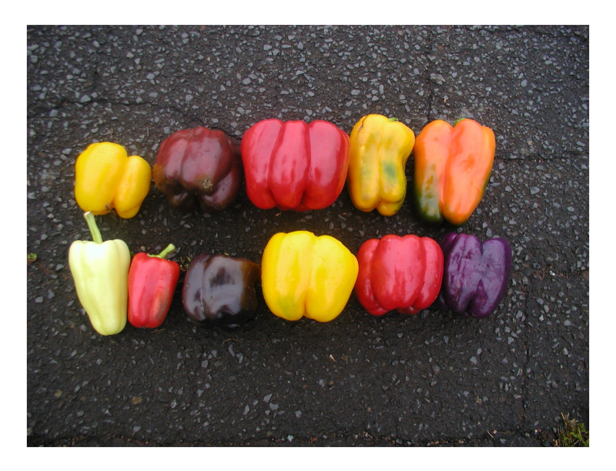
Colored Sweet Bell Peppers 10 cultivars evaluated