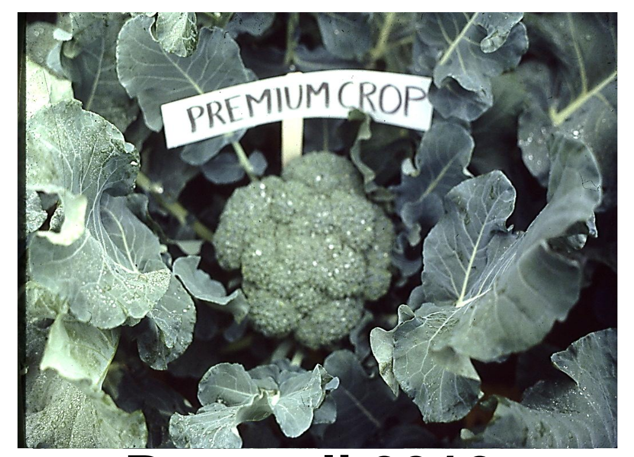
Broccoli 2012 102 cultivars evaluated