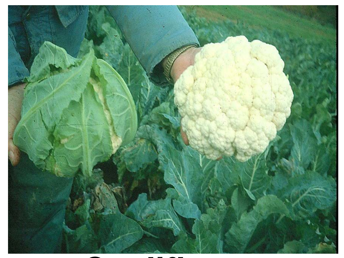
Cauliflower 69 cultivars evaluated