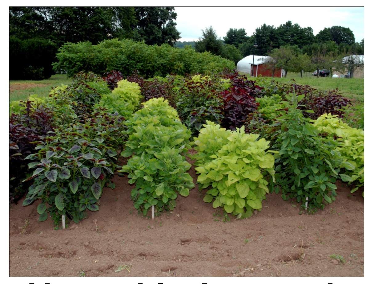
Vegetable Amaranth 8 cultivars evaluated