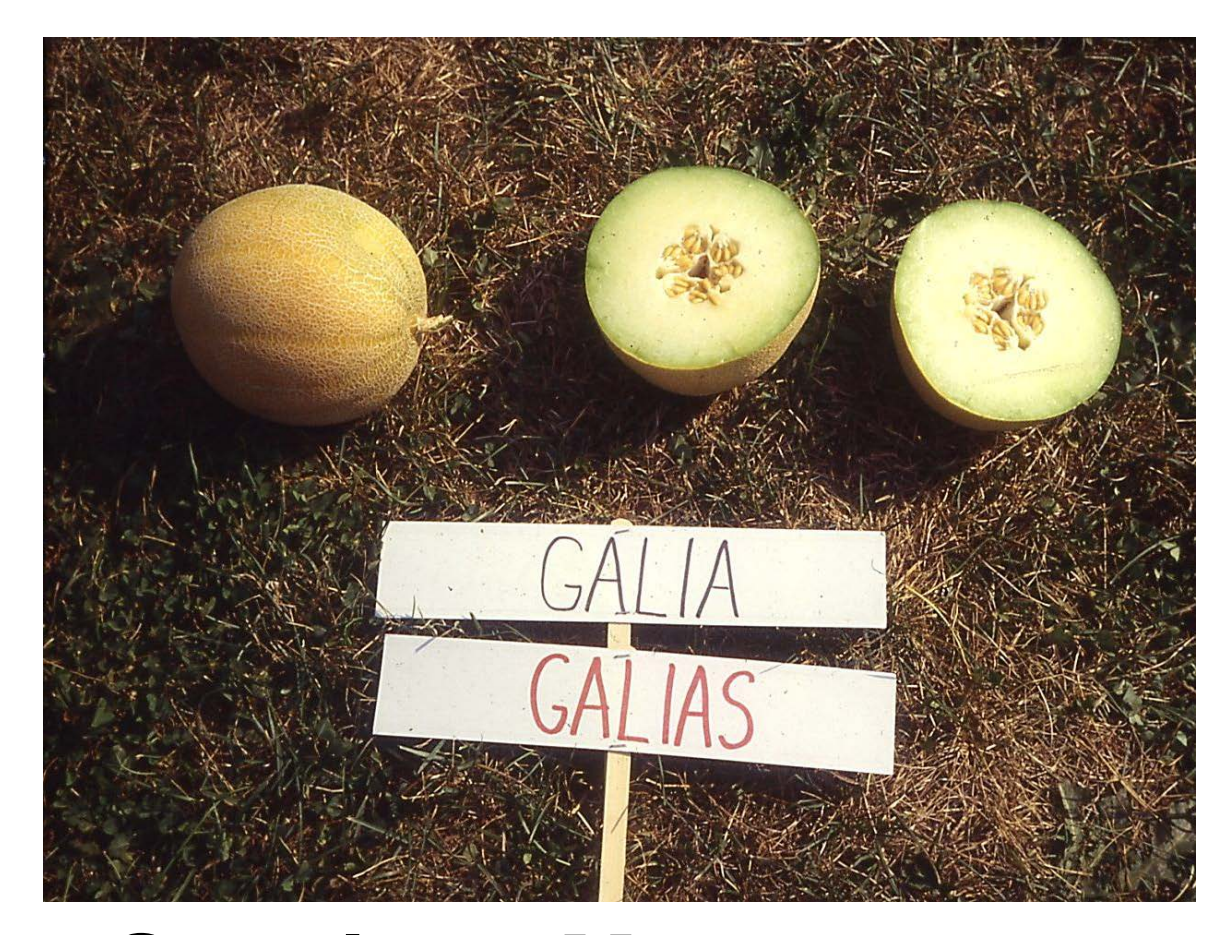
Specialty Melons 2012 16 cultivars evaluated