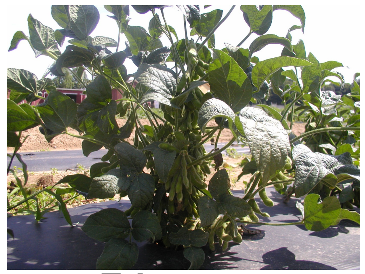
Edamame 15 cultivars evaluated