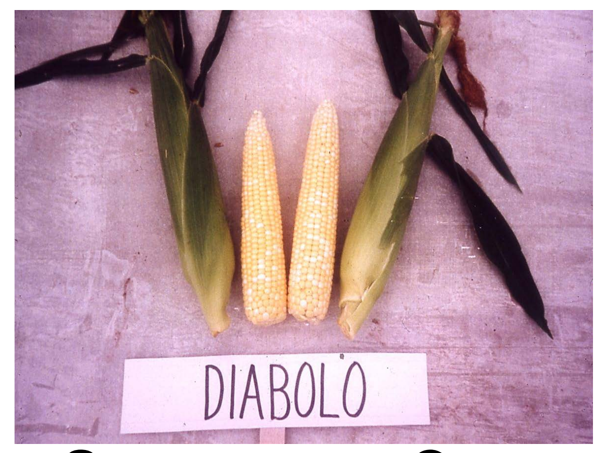
Supersweet Corn 42 cultivars evaluated