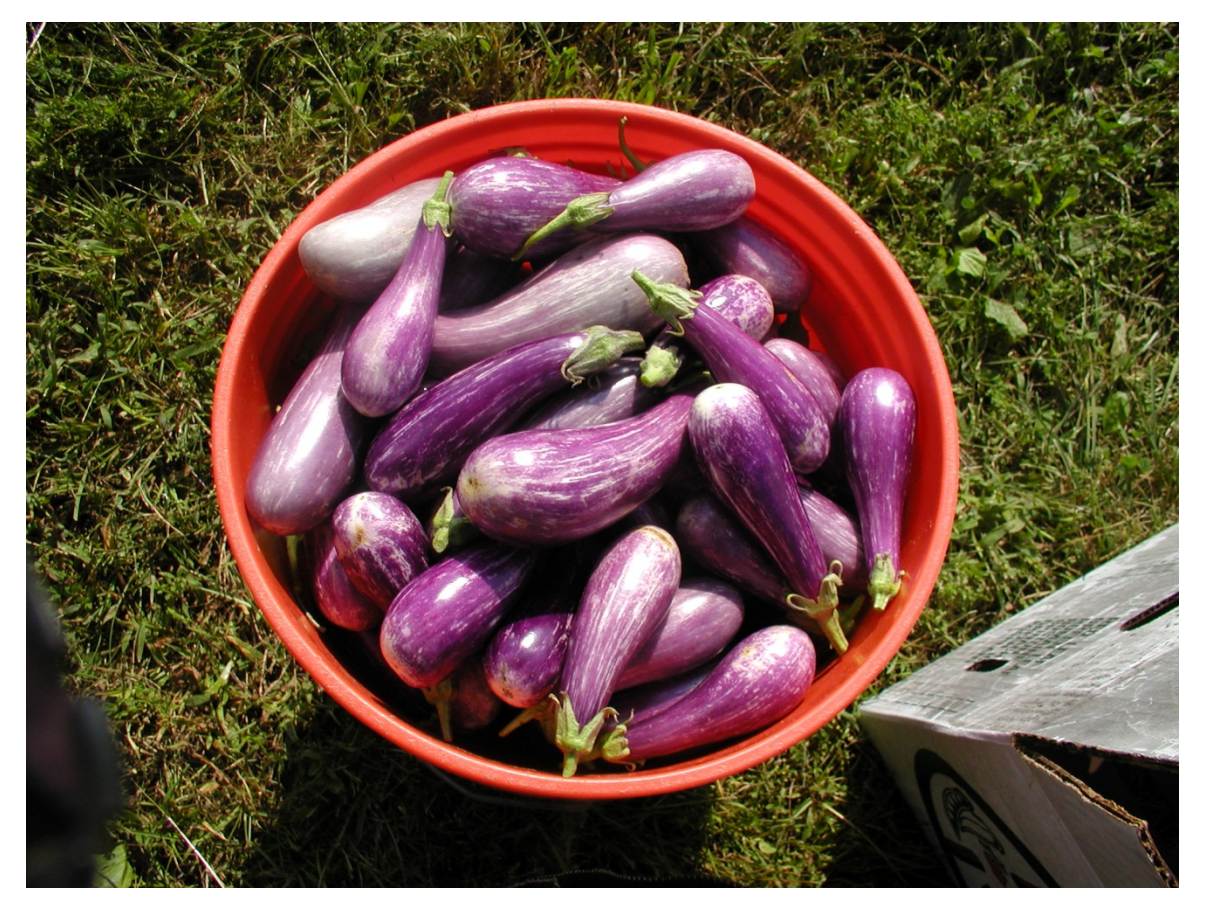
Specialty Eggplant 11 cultivars evaluated