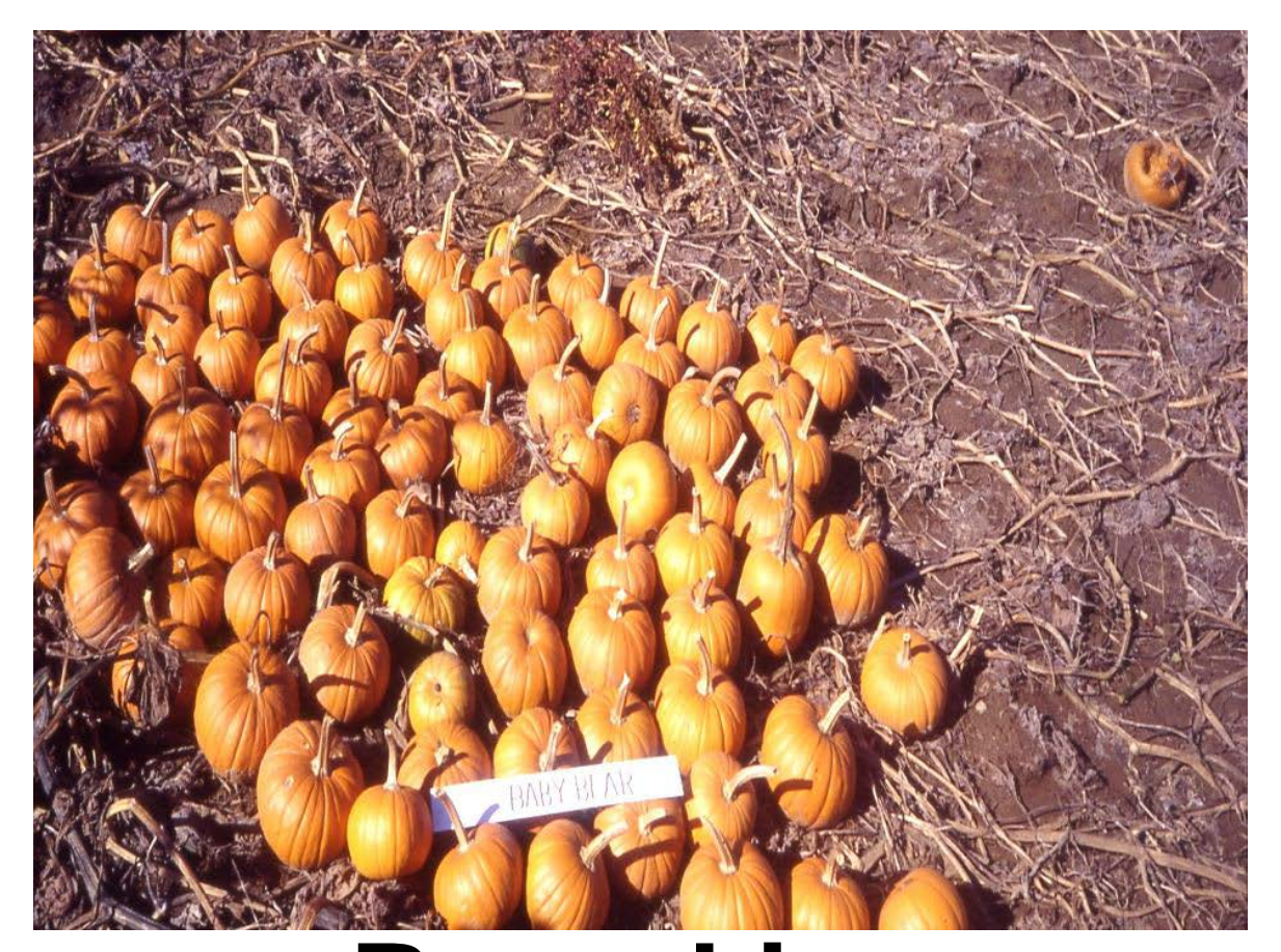
Pumpkins 27 cultivars evaluated