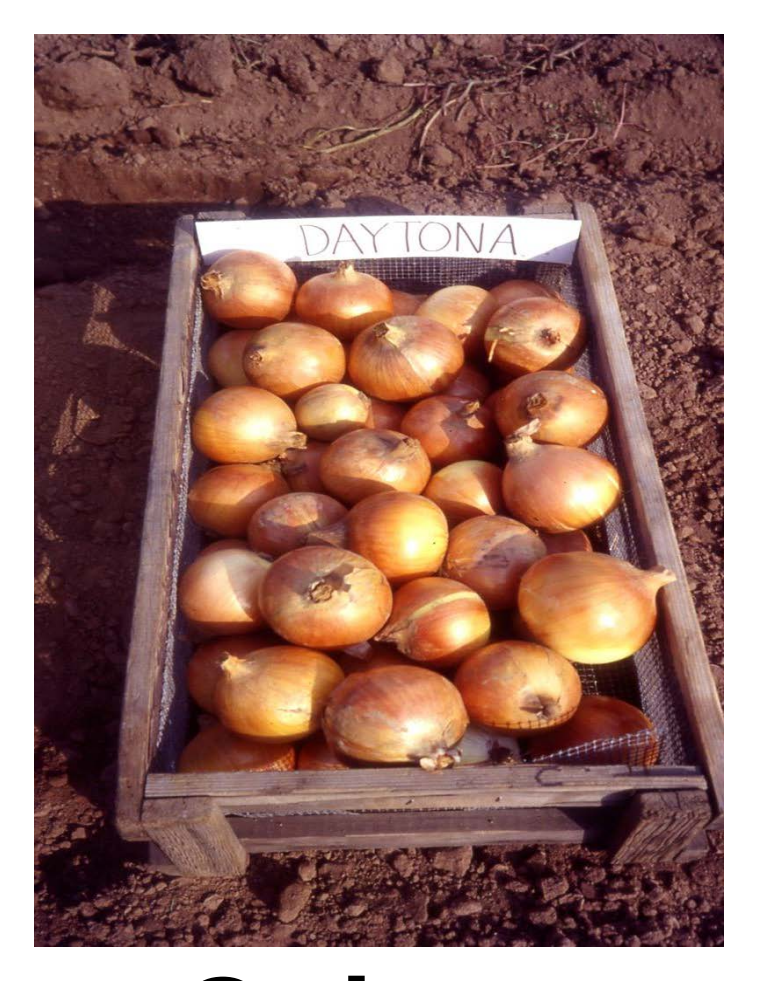
Onions 35 cultivars evaluated