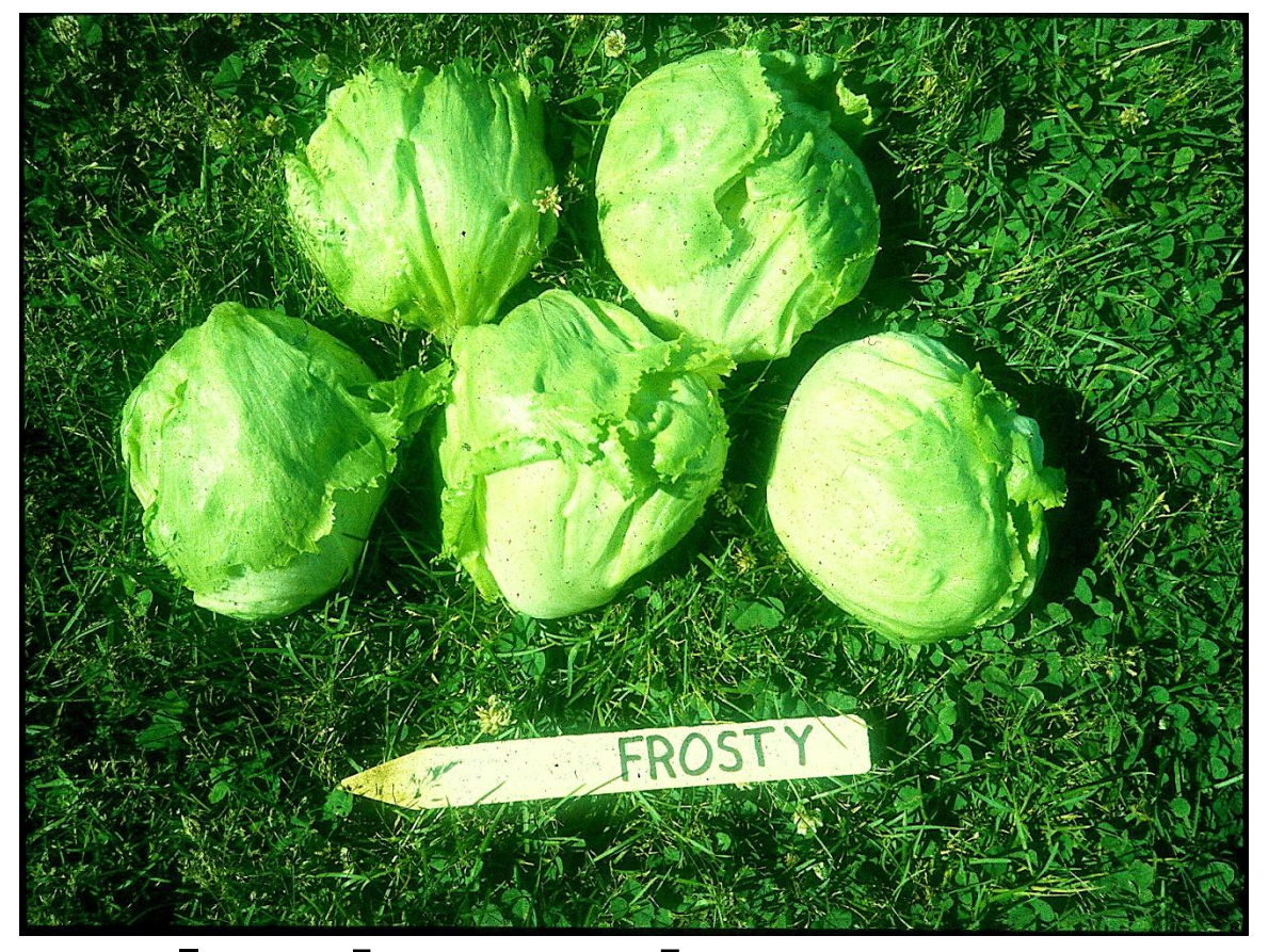
Iceberg Lettuce 15 cultivars evaluated