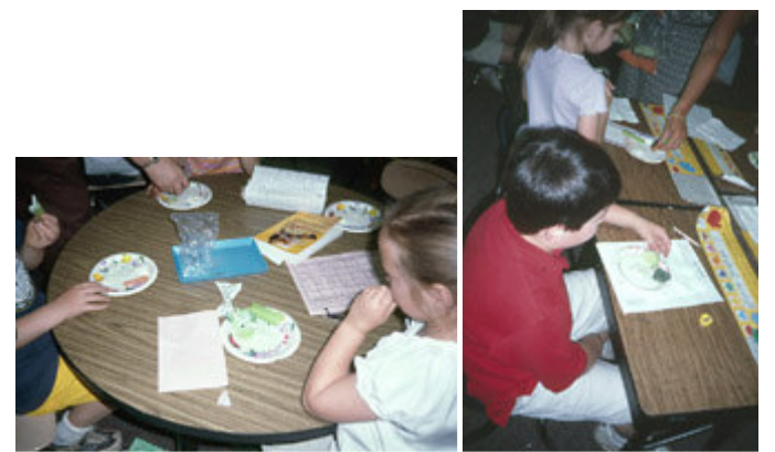
Figures 1 & 2. First grade children eating different plant parts. Click images for a larger view.

This exercise is designed for young children (K to 3) to teach the different parts of a plant (root, stems, leaves, flowers, fruit, and seeds), the basic functions of each part, and to show that tiny microscopic organisms ("germs") can cause each part of a plant to become diseased. The lesson provides the opportunity to instruct children about different "germs" that infect plants. The laboratory section highlights the lesson by having the children eat different parts of a plant, i.e. a root (carrot), a stem (celery), a leaf (lettuce), a flower (broccoli floret), a fruit (cucumber), and a seed (popcorn) (Figures 1 & 2). The lesson shows children the importance of understanding what causes plants to be sick and the need for scientists called plant pathologists to keep plants healthy. The lesson should last approximately 20 min followed by a 20 min laboratory.