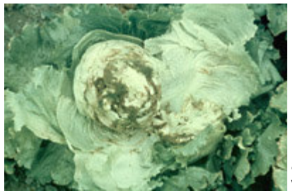
Figure 5. Bacterial soft rot of lettuce. (Pathogen = bacterium; bacteria are single-celled microscopic organisms.) Click image for an enlarged printout view.

4. Flowers provide nectar, attract insects, and produce fruits and seeds. Show examples of edible flowers: rose hips, broccoli florets and artichokes. Flowers may become diseased (Figure 6).