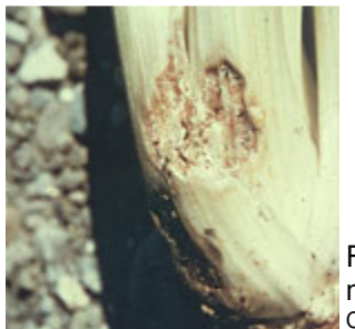
Figure 4. Sclerotinia pink rot of celery. (Pathogen = fungus; fungi are usually microscopic multicellular organisms that can be beneficial or harmful to plants.) Click image for an enlarged printout view.

2. Stems carry nutrients and water up and down the plant, and support the leaves. Show examples of edible stems: asparagus, celery, or rhubarb. Stems may become diseased (Figure 4).