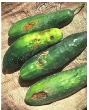
Figure 7. Cucumber belly rot. (Pathogen = fungus; fungi are microscopic multicellular organisms that can be beneficial or harmful to plants.) Click image for an enlarged printout view.

5. Fruits have the seeds inside. Show examples of edible fruits: apples, oranges, green peppers, or cucumbers. Explain that although cucumbers, tomatoes, green peppers and pumpkins are grown and sold as vegetables, they are actually fruits because they are produced from flowers and contain seeds. Fruits may become diseased (Figure 7).