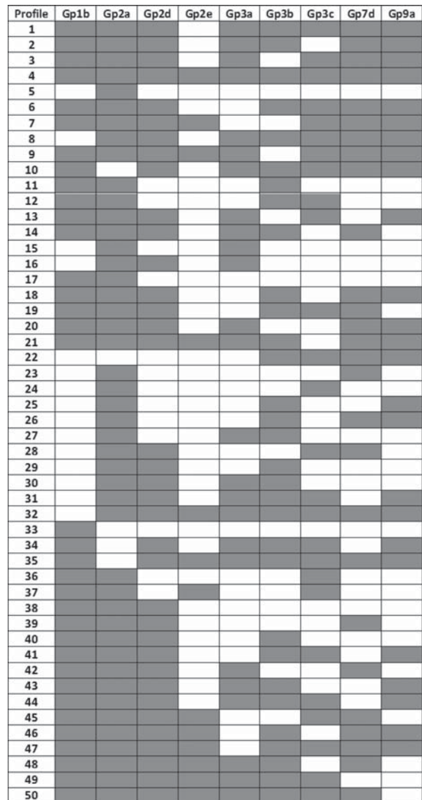
Fig. 1. Bacteriophage WO genetic profiles based on combinations of nine genetic markers of five genes, identified in Cx. pipiens sampled in metropolitan Chicago, IL. Fifty profiles are depicted. Marker patterns are represented as follows: dark boxes indicate positive results (PCR amplification of the gene segment as visualized by bands on gel), and white boxes indicate negative results. Profiles are organized from most to least common.

Multiple regression revealed a statistically significant relationship between the WO prophage genetic markers and Cx. pipiens f. pipiens and Cx. pipiens f. molestus ancestry. For Cx. pipiens ancestry, the regression model was significant ( F_{9,156} = 1.98; P = 0.04 ) and varied significantly with marker Gp2d (Gene product 2d: partial putative capsid protein (Fujii et al. 2004, Duron et al. 2006) (Coefficient = 8.5; t = 2.51; P = 0.013 ). When marker Gp2d was absent ( n = 29 ), Cx. pipiens f. pipiens ancestry was 90.3%, whereas when the marker was present ( n = 137 ), Cx. pipiens f. pipiens ancestry was 97.8% (Fig. 3). None of the other eight markers was associated with Cx. pipiens f. pipiens