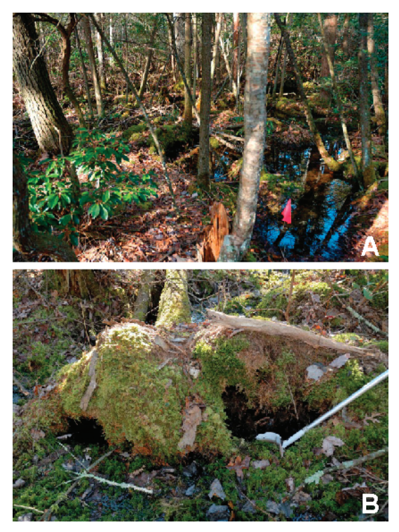
Fig. 1. (A) Seasonally flooded evergreen forest swamp habitat for Culiseta melanura where study was conducted in south central Connecticut. (B) A typical Cs. melanura larval habitat. A moss-covered water-containing subterranean cavity under the base of tree roots.

were combined for analysis. Data on the proportions of each instar were subject to regression analysis (Systat 2008) from mid-December through mid-April (18 wk) to ascertain possible development and/or mortality during the winter months. Similar analysis was conducted from mid-April through the end of May (7 wk) in an effort to document the initiation of renewed development in the spring. The emergence of adult populations was additionally monitored with the 1st detection of pupae in early May by the deployment of 6 CO<sub>2</sub>-baited Centers for Disease Control and Prevention miniature light traps and an equal number of nestable fiber pot resting boxes that were placed in the immediate vicinity of the larval collection sites on May 10 (Komar et al. 1995).