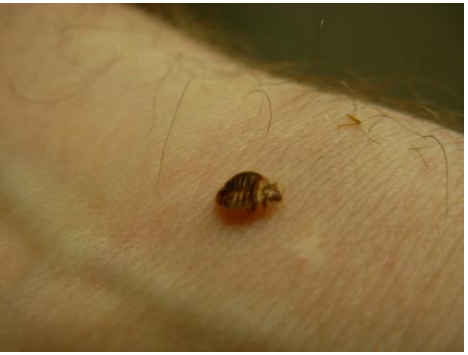
Bed bug fecal spots