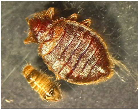
Bed bug compared with a carpet beetle larva (left)