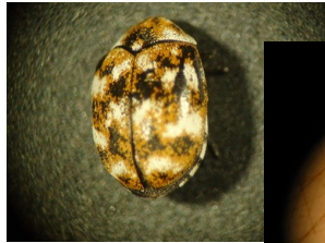
Varied carpet beetle