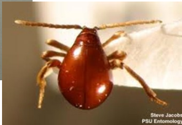
Spider beetles etc.