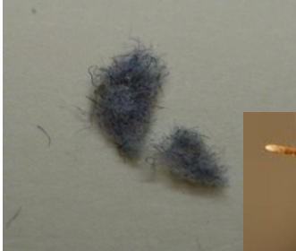
Lint and/or debris