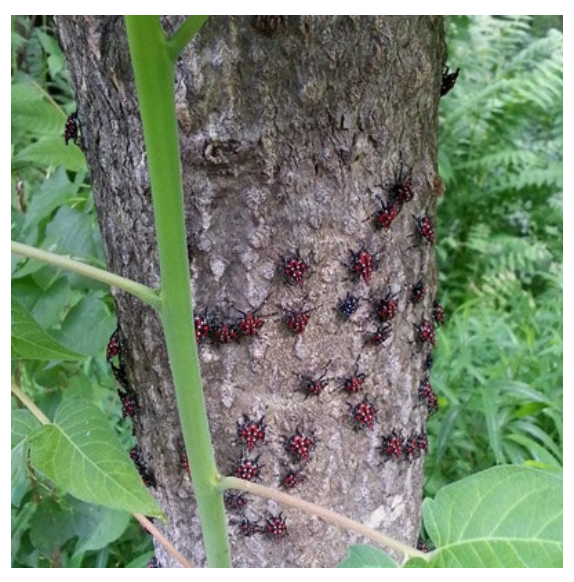
Figure 2. Late stage SLF nymphs.

When you travel in and out of restricted areas, don't forget to check your truck and any equipment used (landscaping supplies, mowers, etc.). Check for SLF egg masses from September through June. Remember that egg masses may be underneath your truck or in your wheel wells. During all other times of the year, check for nymphs and adults, and keep your windows rolled up when you park. Don't store things or park under infested trees.