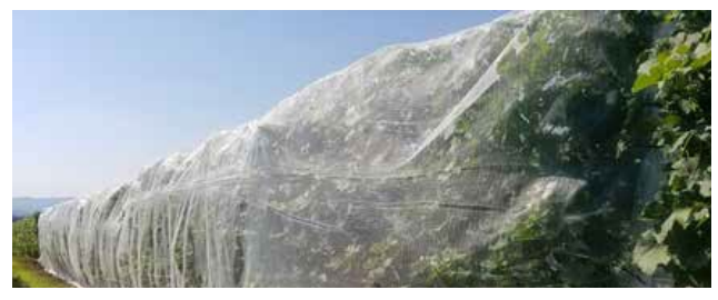
Figure 3. Exclusion netting (DrapeNet, Chazy, New York) used to protect vines from SLF. Note that this netting is tightly closed on the sides and bottom to prevent entry by SLF. County, Pennsylvania.

Placing circle traps around trees or banding trees with sticky tape can be useful monitoring tools for vineyards that have not vet detected SLF. However, use of traps is not a recommended control tactic around vineyards, as it is very unlikely to reduce the population. If using sticky bands, bycatch of nontarget insects (bees, butterflies, natural birds. and mammals enemies, etc.), (squirrels, bats, etc.) is likely. A wildlife barrier (e.g., window screening) should be built over the trap to prevent this bycatch. More details on trapping can be found on the Penn State Extension website.