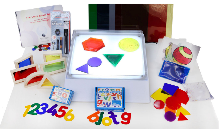
Light Box Kit #3114 from Enabling Devices

Enabling Devices 50 Broadway Hawthorne NY 10532 800-832-8697 <u>www.enablingdevices.com</u>