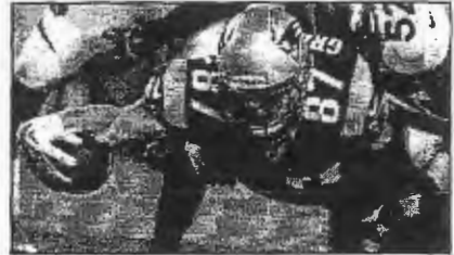
Patriots tight end Rob Gronkowski (87) against Denver.

player," defensive end Rob Ninkovich said. "He's one of the best guys you could ever meet. He's a great guy off the field. He'll say 'hi' to anybody. He'll do anything for you."