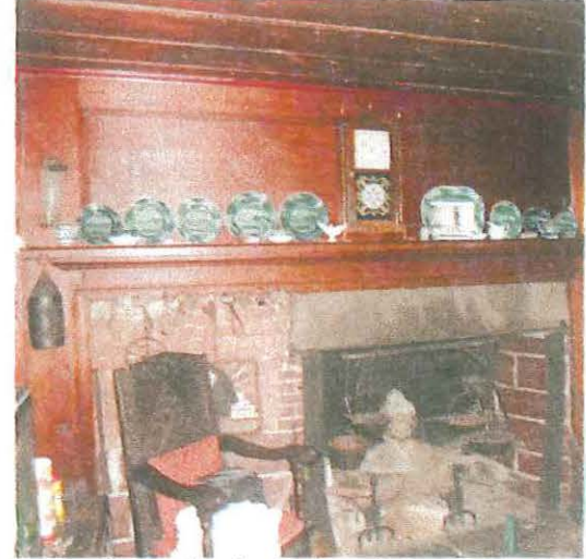
Former kitchen showing feather-edged ceiling paneling.

The house is in relatively good physical condition and most of the work required for its maintenance is cosmetic rather than structural. One lower windowsill needs replacement. Ice dams are causing melt water to back up under the roof shingles. Although the site was kept by Howard Metzger in superb condition, it has