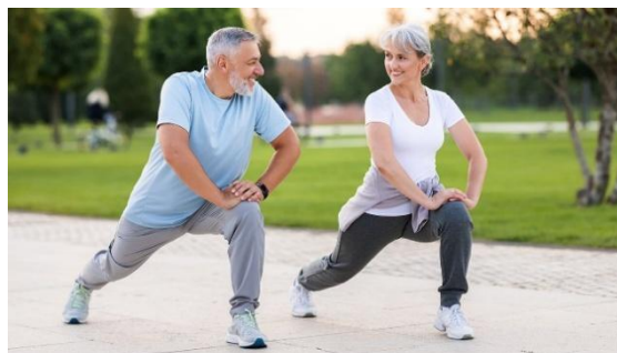
12 Best Exercises and Workouts for Seniors