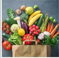
Whatever veggies you want!