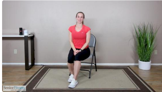
Cognitive Disability Fitness | Range Of Motion Exercises | 9 Min - YouTube