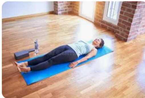
25 MIN FULL BODY PILATES WORKOUT FOR BEGINNERS (No Equipment)