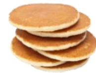
Table 1 shows how to use method 1 to calculate the oz eq of commercial grain products in groups A-E. This example is for whole-wheat pancakes, a commercial product in group C. Table 2 shows a sample calculation for this same product using method 2.

These examples show how each method can result in a different crediting contribution for the same product. For some products, each method results in the same crediting contribution. SFAs may use either method but must document how the crediting information was determined (refer to “ Choosing a Calculation Method ” in this document).