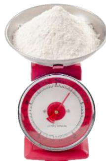
Table 5 shows how to use method 2 to calculate the oz eq for a standardized recipe for multi-grain bread that lists the weight of the grain ingredients. Bread is in group B of the USDA’s Exhibit A chart and requires 16 grams of creditable grains to credit as 1 oz eq of the grains component. To credit as 1 oz eq of a WGR food, the 16 grams of creditable grains must include at least 8 grams of whole grains.