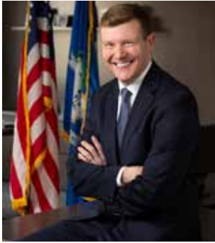
Sean Scanlon State Comptroller @CTComptroller