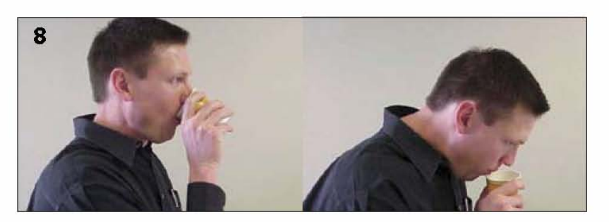
Rinse your mouth out after you take your last puff of medicine. Make sure you spit the water out; do not swallow it. Rinsing is only necessary if the medicine you just took was a corticosteroid, such as Flovent®, Beclovent®, Vanceril®, Aerobid®, or Azmacort®.