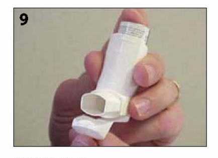
Recap the MDI.

The American College of Chest Physicians is the leading resource for the improvement of cardiopulmonary health and critical care worldwide. Its mission is to promote the prevention and treatment of diseases of the chest through leadership, education, research, and communication.