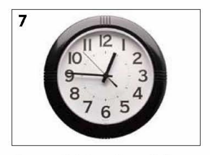
If you need to take another puff of medicine, wait 1 minute. After 1 minute, repeat steps 2-6.