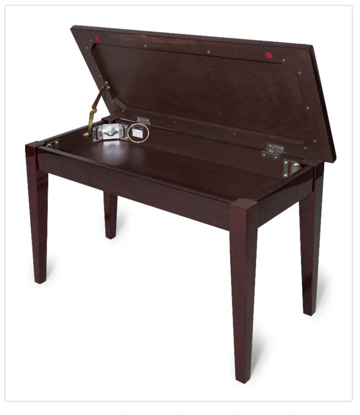
Location of model number and date code on recalled piano bench