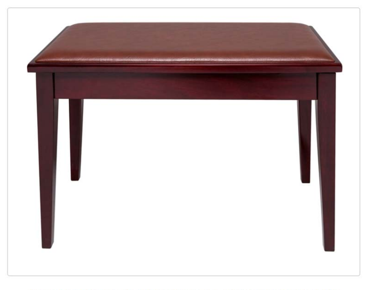
Recalled piano bench 3 I PM / PAW sold with Yamaha grand piano model GB1K PM / ${\rm PAW}$