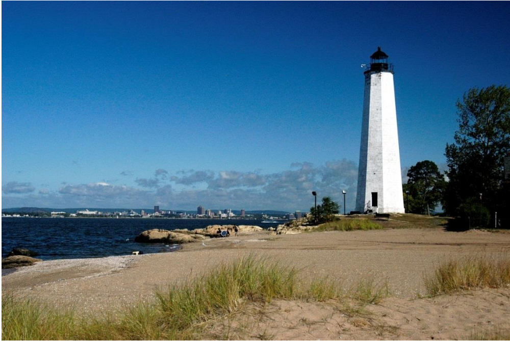
Lighthouse Point Park, New Haven