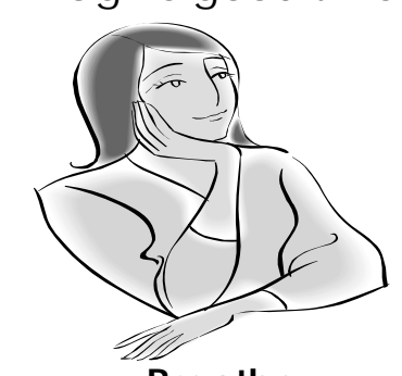
Breathe Sit down. Close your eyes. Take slow, deep breaths. Let your body melt.