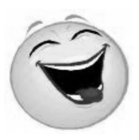
Laugh Often Laugh alone and with others. Enjoy the funny things in life.

Bet you can't do it without feeling happier. Try it.