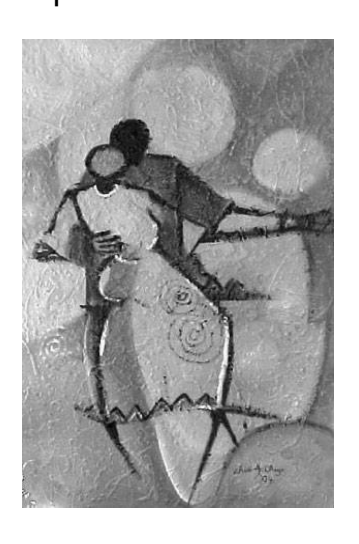
Express Yourself Don't keep it in. Don't explode. Tell a friend how you feel.

Move Your Body Take a walk. Dance. Moving the body helps reduce stress.