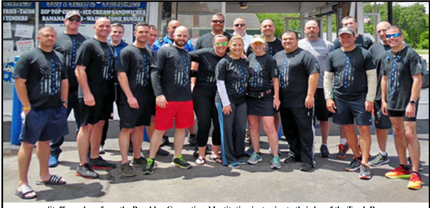
Staff members from the Brooklyn Correctional Institution just prior to their leg of the Torch Run

The Law Enforcement Torch Run for Special Olympics Connecticut is one of the movement's largest fundraisers. This year-round program involves law enforcement officers from across the state who volunteer their time to raise awareness and funds through events they host including Tip-a-Cops, Cop-on-Tops, and Jail N' Bail fundraisers. In addition, each year in June, over 1,500 officers and athletes carry the Special Olympics torch, with its "Flame of Hope," through hundreds of cities and towns across the state, covering over 530 miles in three days. Officers run the "Final Leg" and light the ceremonial cauldron during Opening Ceremonies for the Special Olympics Connecticut Summer Games.