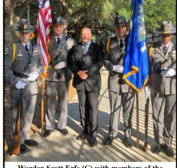
Department of Correction's Honor Guard at the CPOF conference in Houston, Texas.