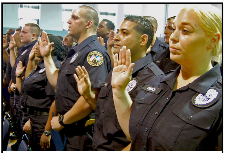
Members of Pre-service Class 269 being sworn in during the graduation ceremony on July 5.

correctional trainees graduated after successfully completing the pre-service training program. The composition of the class included 97 Correction Officers, 20 Correctional Counselor Trainees, 8 Correctional Counselors, 3 Correctional Treatment Officers, 1 Substance Abuse Counselor, 8 School Teachers, 4 Vocational Instructors, 3 Instructional Assistants, 2 Pupil Services Specialists, 1 General Maintenance Officer, 1 Steamfitter, 2 Store Supervisors, and 1 Food Service Supervisor.