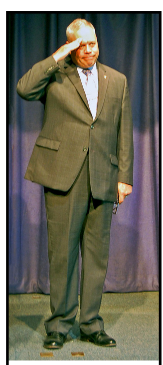
Commissioner Semple Salutes the Deparment's newest members.

The final message that the Undersecretary shared with Class 269 was that, "we are counting on you." He stressed the importance of their work in not only protecting the public, but also in helping to prepare the offenders for their return to society.