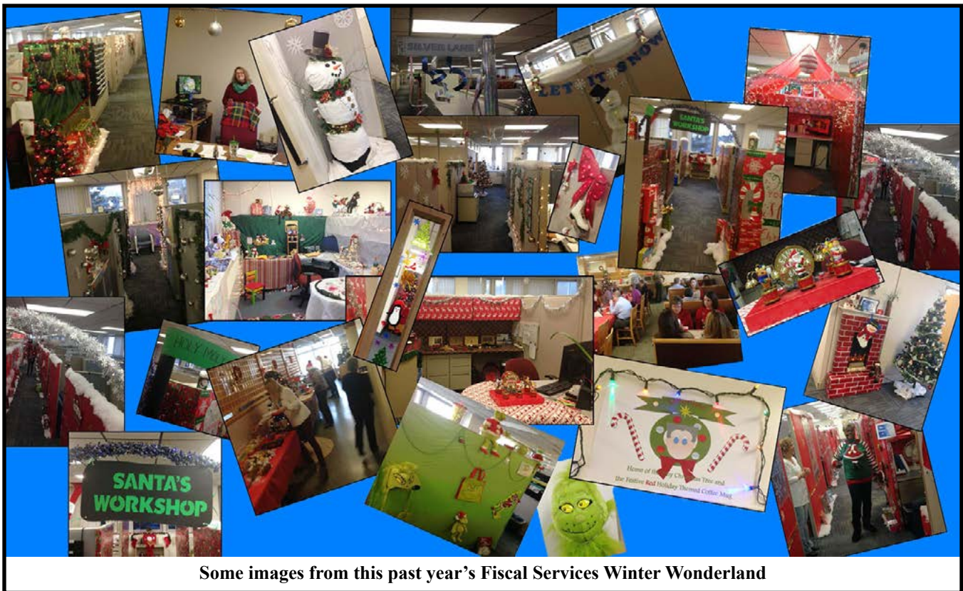
Some images from this past year's Fiscal Services Winter Wonderland