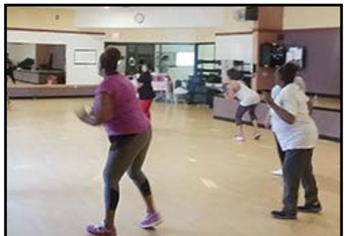
Participants in the Osborn CI sponsored Zumba class