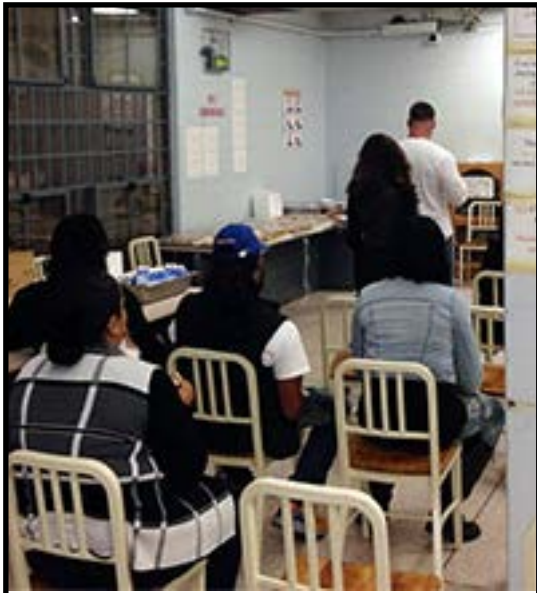
Family and friends gather in the Osborn CI visiting room for the facility’s “open house”