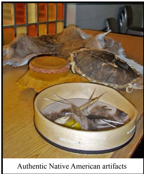
Authentic Native American artifacts