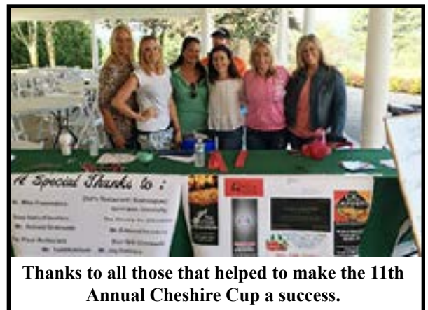
Thanks to all those that helped to make the 11th Annual Cheshire Cup a success.

Monies raised will go to benefit Special Olympics of Connecticut and various facility QWL committees. Without the help of all those involved, the tournament would not have been a success - thank you.