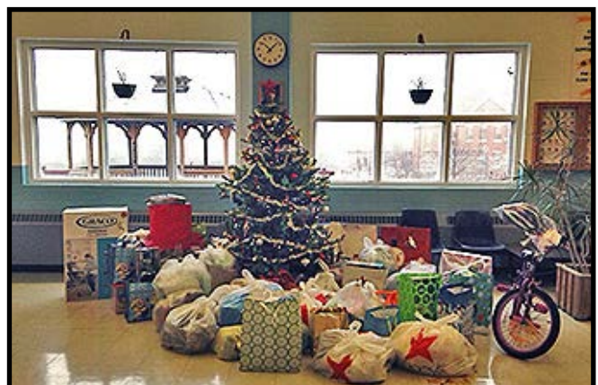
Gifts for Children under the care of DCF courtesy of staff of the Brooklyn Correctional Institution.