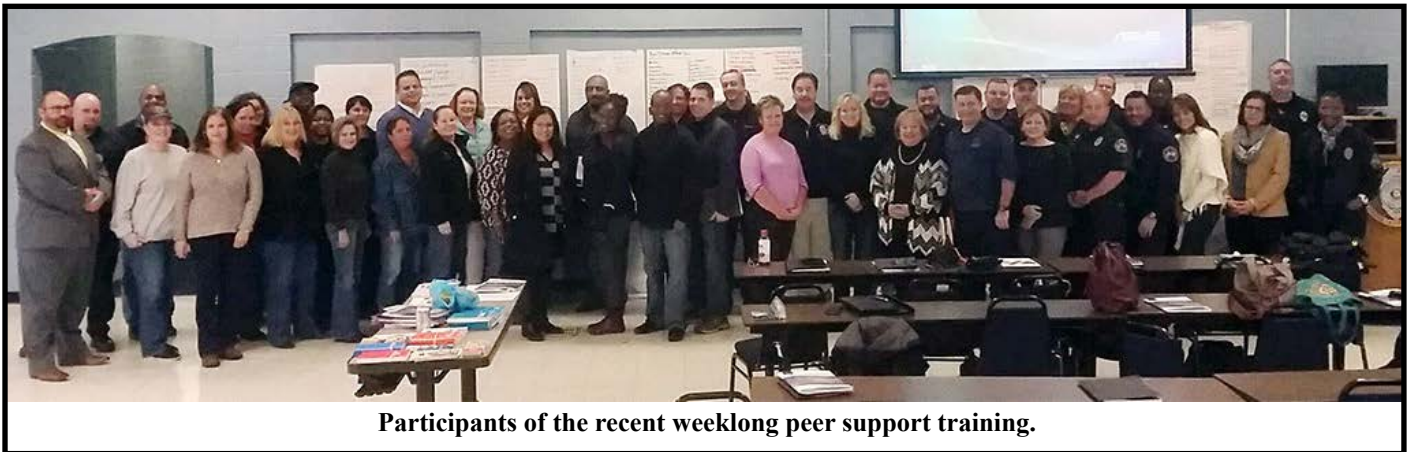
Participants of the recent weeklong peer support training.

As part of the agency's latest employee wellness initiative, the POWER Program's Post Incident Response Committee facilitated a weeklong peer support training program in conjuncture with the Connecticut Alliance to Benefit Law Enforcement Inc (CABLE). Approximately 50 department staff members attended the training which was held November 28 through December 2 at the Maloney Center for Training and Staff Development. A goal of the POWER Program is to establish a peer support network - points of contact throughout the agency who would provide peer support with the ultimate objective of reducing the negative effects of trauma on staff.