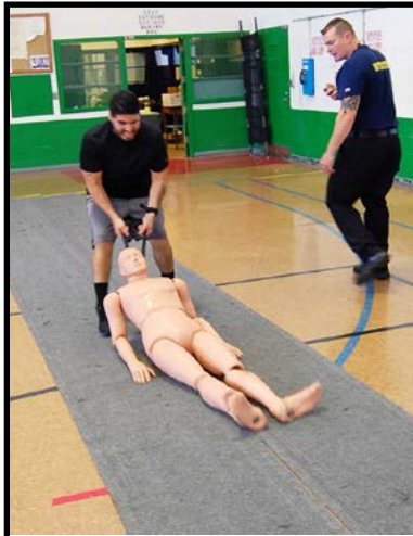
An Officer participates in the Validation Study at Osborn CI

August 3, 2016 through September 16, 2016