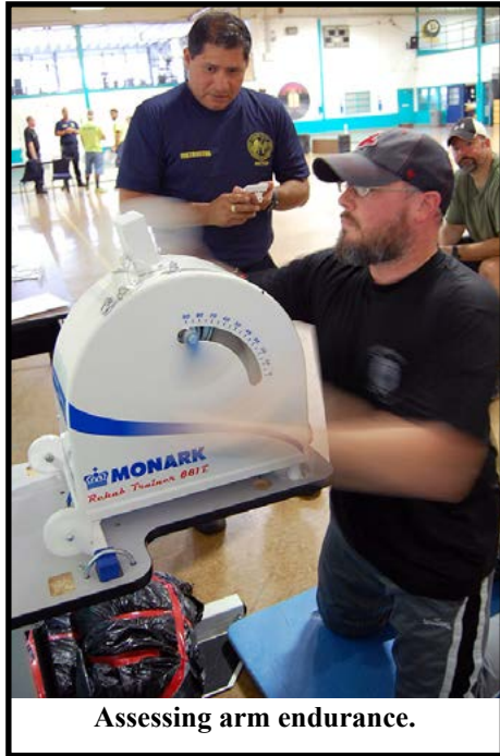
Assessing arm endurance.

Phase 1 was project planning which involved educating the vendor HumRRO – The Human Resources Research Organization, on our current recruitment process, medical screening process, and work environment across different security levels. HumRRO staff members toured a number of facilities and obtained valuable information regarding the work of a Correction Officer through small focus groups at each facility. Phase 2 was launched last summer when over 500 staff were asked to complete a Job Analysis Questionnaire. This questionnaire was analyzed and the essential job functions of a Correction Officer were identified. Using this data, HumRRO then established a linkage between the data collected and the physical abilities required to