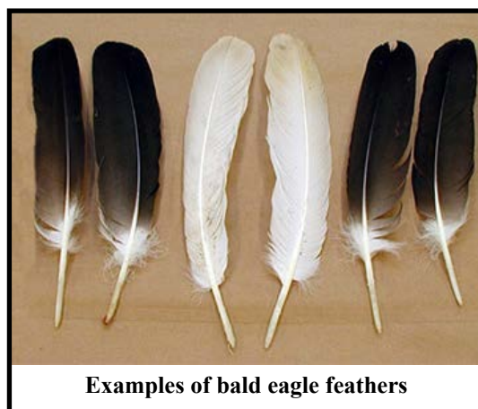
Examples of bald eagle feathers

The U.S. Fish and Wildlife Service operates the National Eagle Repository as a clearinghouse for eagles and eagle parts to provide Native Americans with eagle feathers for religious use. The Repository collects dead eagles salvaged by Federal and State agencies, and other organizations. Members of federally recognized tribes may obtain a permit from the Service authorizing them to receive and possess eagle feathers and parts from the Repository. Permit applications must include certification of tribal enrollment from the Bureau of Indian Affairs.