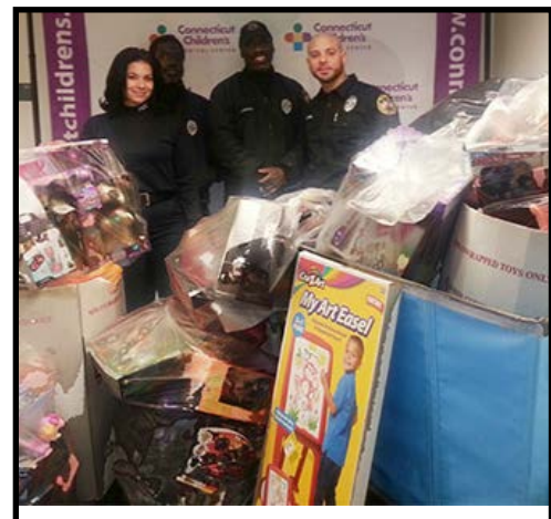
CERT members with their donations to the CT Chidren's Medical Center.

In addition, they sent out care packages to team members currently deployed overseas: Northern CI's Correction