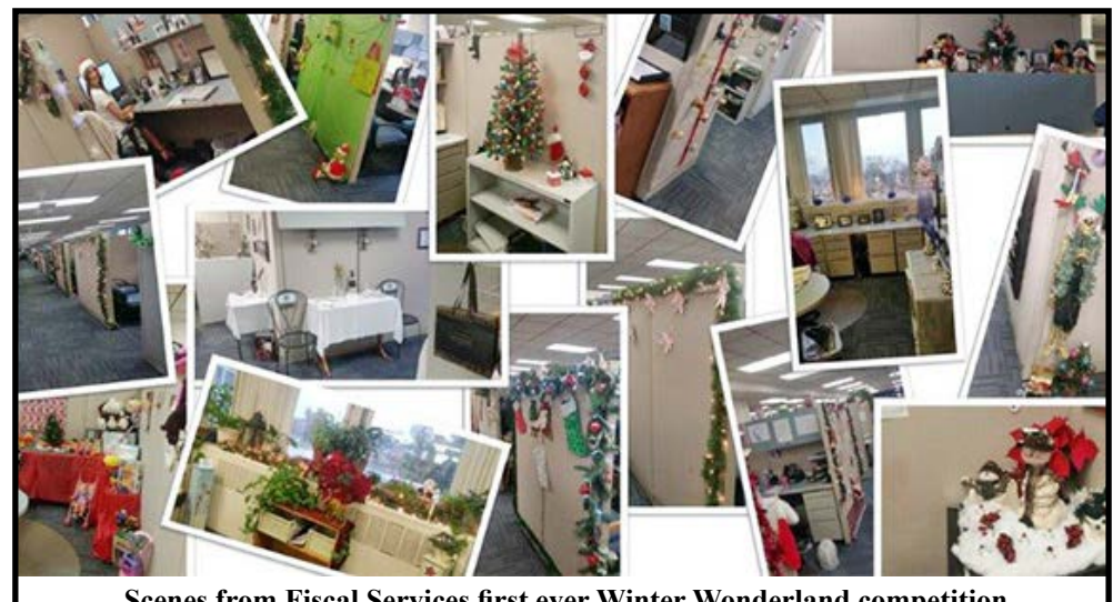
Scenes from Fiscal Services first ever Winter Wonderland competition.

Fiscal Services held a Winter Wonderland around the world decorating contest in which the Central Office staff of Fiscal Services were encouraged to decorate their areas for the holiday season utilizing a global theme. Staff members created a