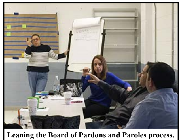
Leaning the Board of Pardons and Paroles process.