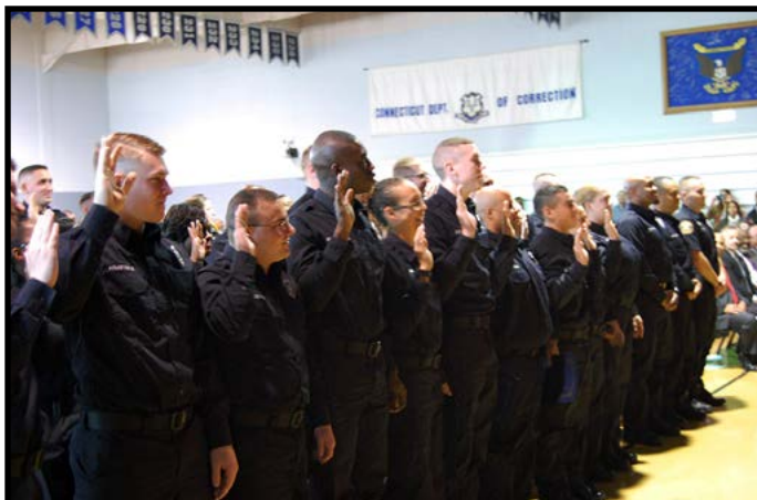
Members of Pre-service Class 266 take the oath.