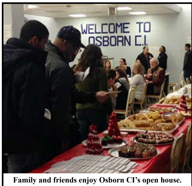
Family and friends enjoy Osborn CI's open house.