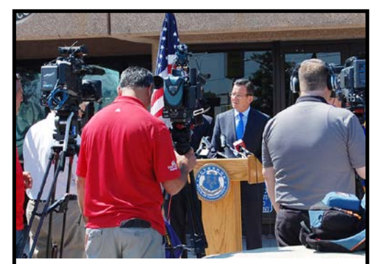
Governor Malloy addresses the media in front of the Hartford Correctional Center.