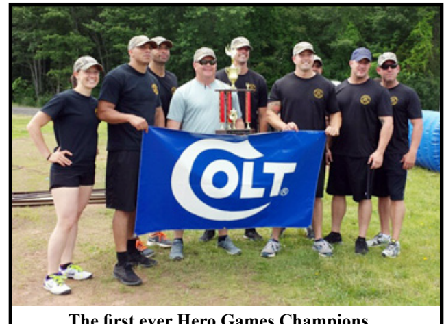
The first ever Hero Games Champions.

Each team could score as many as five points in each of the eight events. The Berlin Police and the Dept. of Correction teams were neck and neck in the lead after the obstacle course and the truck pull, with seven points each. The CERT team pulled ahead during the Medicine Ball Relay, winning the championship by two points, with a total of 34.