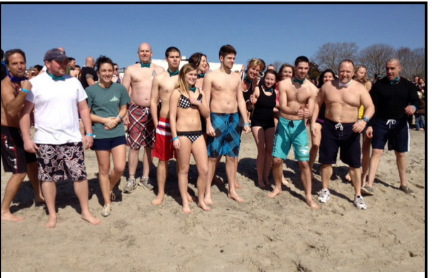
York Correctional Institution staff members prepare to take the plunge prior to the 2013 Penguin Plunge in New London's Ocean Beach Park.

If you have never been to a Special Olympics event to watch or volunteer, it is highly recommended. Everyone comes away having a great time: the athletes, their coaches, as well as all the volunteers.