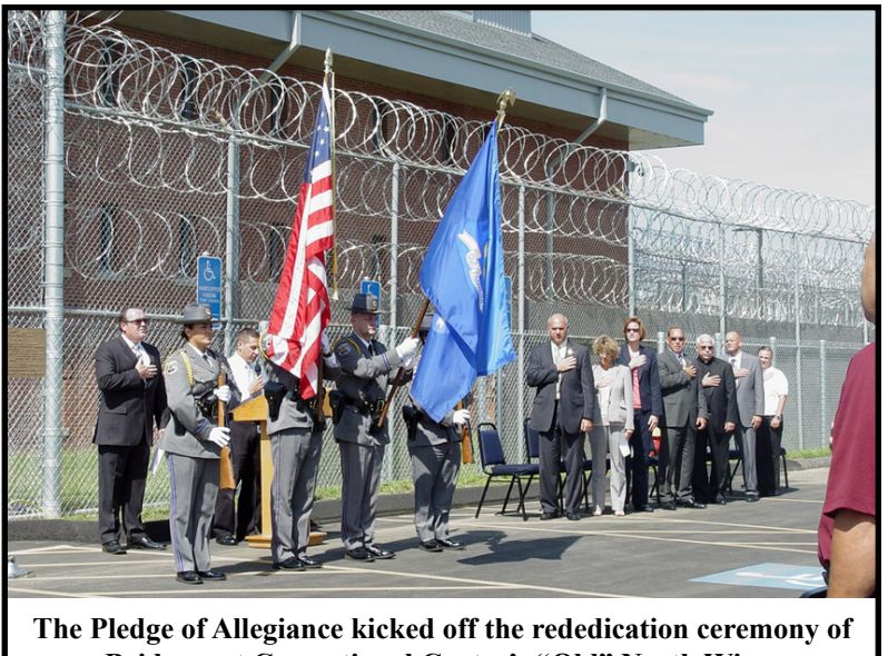
Bridgeport Correctional Center's "Old" North Wing.

Current and former staff of the Bridgeport Correctional Center, along with the agency's administrators gathered outside the facility's North Wing on July 31, 2013, to officially rededicate the newly renovated building.