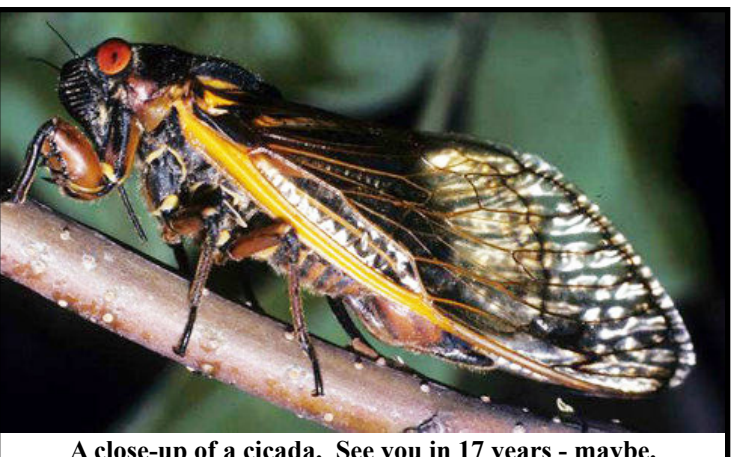
A close-up of a cicada. See you in 17 years - maybe.

Periodical cicadas only live in one area worldwide: in the United States, in areas east of the Great Plains. These species moved there after the last glaciers began leaving the area some 18,000 years ago. The ice would have been inhospitable to the cicadas beforehand.