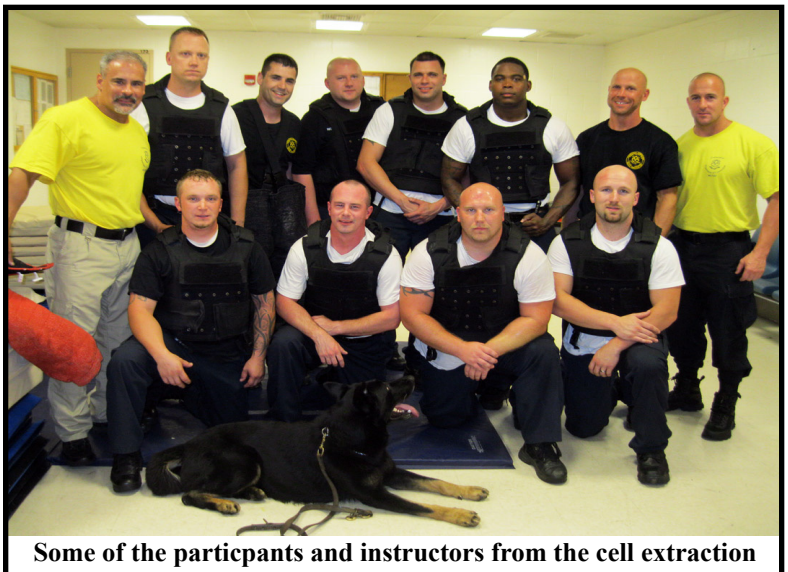
refresher training course conducted at Webster CI.

Hartford Correctional Center and Northern Correctional Institution staff members, along with the guidance and help of staff members from the MCTSD and the Tactical Operations Unit have just completed a cell extraction refresher training course at Webster CI. The 16-hour course was developed by academy staff and several supervisors from throughout the state.