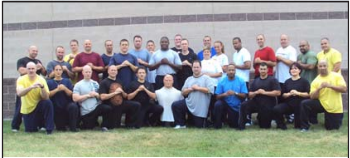
Newly trained Behavior Management Instructors and their trainers.

The Maloney Center for Training and Staff Development in preparation for In-service Training has been conducting Behavior Management and CPR Instructor Training for Trainer classes. Staff from various facilities including Parole and Community Services participated in intensive 1-day and