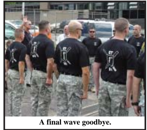
A final wave goodbye.