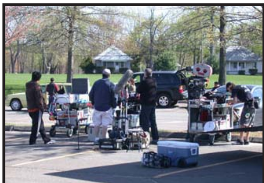
The film crew for the movie We Need to Talk About Kevin set up for a shot in the parking lot of Webster CI.

Swinton plays the role of Eva, a smart, educated mother trying to come to terms with the aftermath of her 15-year-old son's killing spree. She was on-hand at Cheshire to shoot exterior scenes of her arriving at a facility where her "son" was being held after his arrest. Also starring in the role of Kevin's father, Franklin, is John C. Reilly of Talladega Nights , and Chicago fame. Reilly did not make the trip to Cheshire.