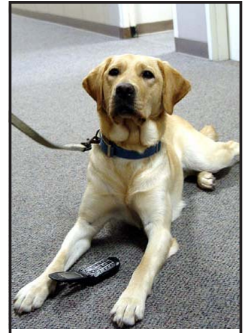
Rhianna - The Cell Phone Dog

Rhianna was donated by Guiding Eyes for the Blind in Yorktown Heights, N. Y., which raised the dog for the first 18-months of it's life. It costs approximately $45,000 for the organization to train a puppy to become a guide dog.