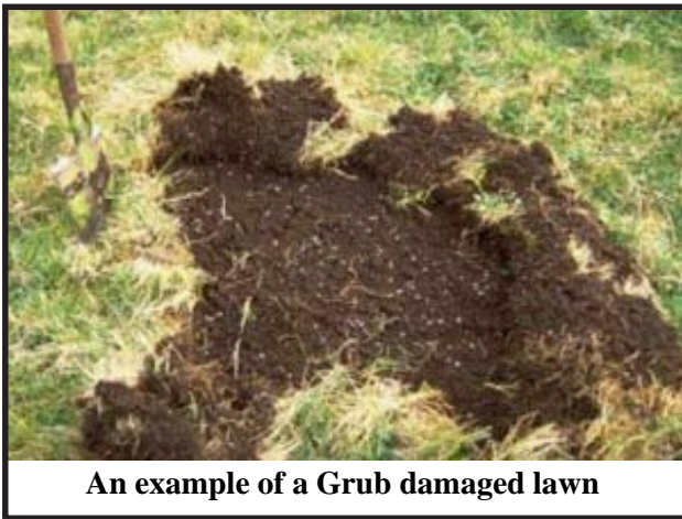
An example of a Grub damaged lawn

If annual weeds are an issue, then patching comes into play. Annual weeds such as crabgrass and dandelions spread by reseeding themselves every year. Applying a pre-emergent herbicide in the spring and then reseeding bare areas that occur can control these weeds. If your lawn is thin or has brown patches, you may have soil issues or grubs.