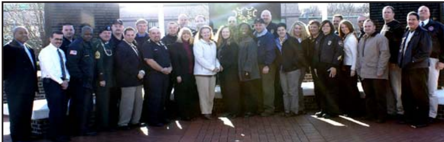
Members of the DoC Military Peer Support Group attend specialized training at MCTSD in December