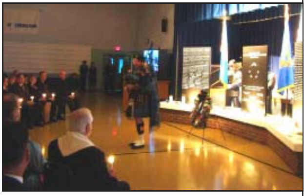
see Memorial page 3

The storm clouds and gloomy conditions served to punctuate the somber mood of family, friends and staff gathered to pay tribute to those members of the Department who had passed away during the previous year.