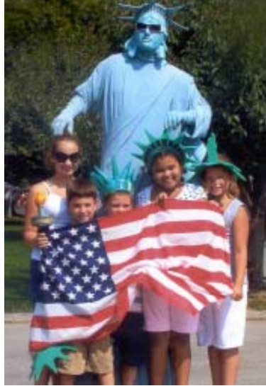
Kids from the group showing their "American PRIDE."