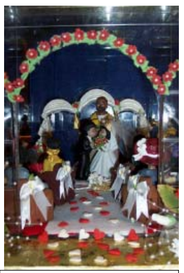
Close-up view of the front of the "jumping the broom" cake.

ICES is an international nonprofit organization dedicated to the promotion and advancement of the sugar arts. Membership includes a varied assortment of sugar artists, ranging from hobbyists and