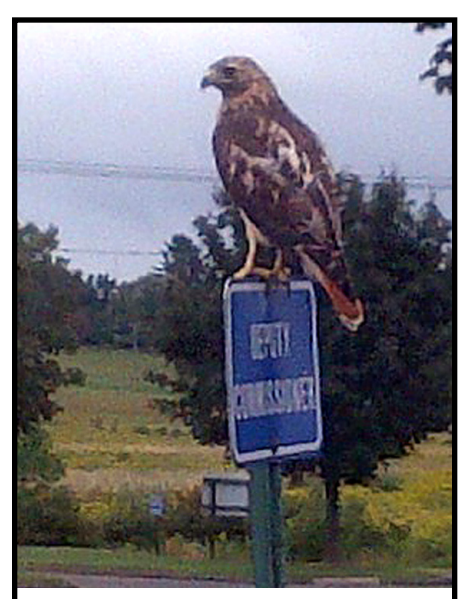
A red tailed hawk was recently spotted keeping an "eye" on the Deputy Commissioner's parking spot outside the Willard Building.

I relate this to you only as a reminder. We all have good friends and loved ones that are part of our lives at work and out of work. Remember them every day, honor them every day. They make our existence worthwhile and they rely upon us to be part of the fabric of their lives. Live life.