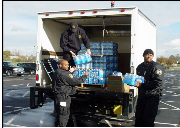
DoC staff distribute emergency water supplies from the FEMA distribution center at Rentschler Field in East Hartford.

In the wake of super-storm Sandy, which devastated many communities along the shoreline, staff members from the Connecticut Department of Correction (DoC) are assisting in the recovery process. As they did after last year's freak October snowstorm, personnel from the DoC staffed the Emergency Operating Center located within the State Armory in Hartford