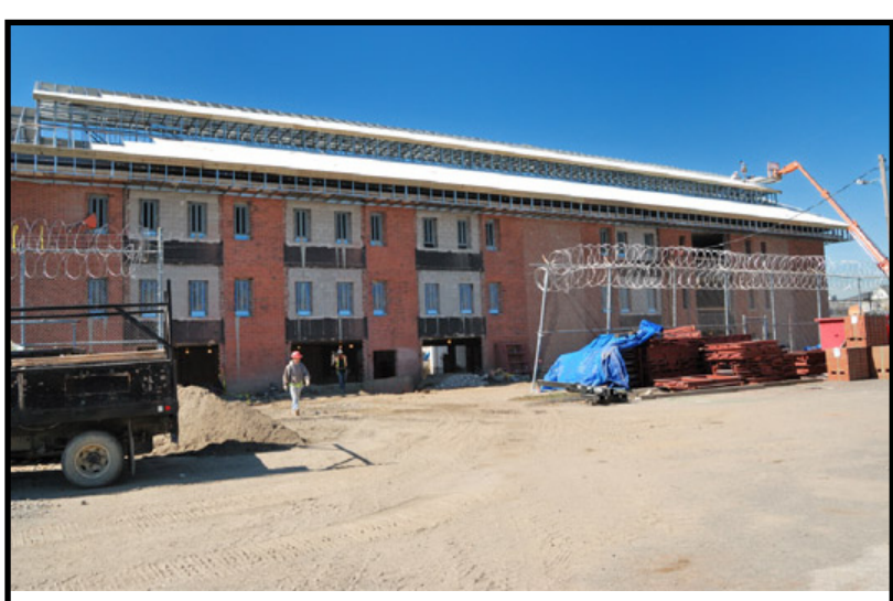
A new pitched roof is being installed on the Old North Wing of the Bridgeport Correctional Center.

With the Bridgeport North wing renovation project nearly halfway complete, Plant Facilities Engineer Jay Harder took the opportunity to take some photos, and provide an update of the progress.