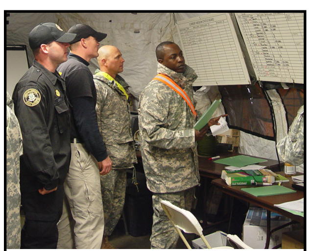
DoC staff members check the mission board at the FEMA distribution center at Rentschler Field.

In addition to the central emergency operating center, staff also helped out at the five regional emergency center offices as well. Numerous members of the department's tactical units were deployed to the Federal Emergency Management Agency's (FEMA) disaster relief distribution center at Rentschler Field in East Hartford, where they distributed food and water to various municipalities.