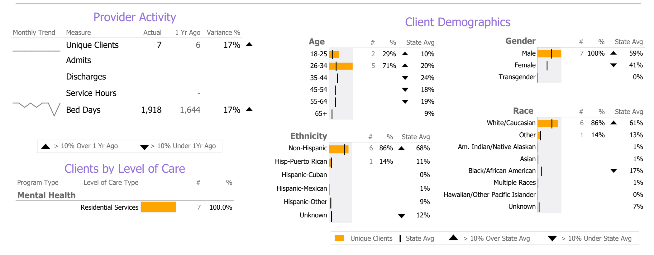
Survey Data Not Available

Reporting Period: July 2022 -March 2023 (Data as of Jul 03, 2023)